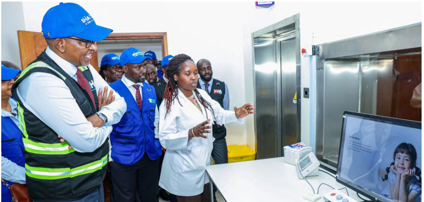
Staff at Longisa County Referral Hospital demonstrate the newly commissioned digital CT scan during Health CS Aden Duale's visit.

T he government has commended the College for its leadership in driving the digital transformation of healthcare, a key pillar in the realisation of Universal Health Coverage (UHC).