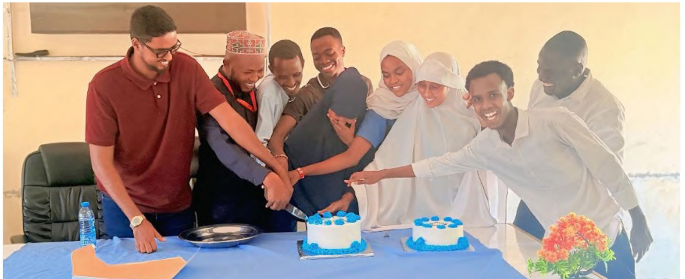
Wajir Campus staff and students during the FQE prayer day.