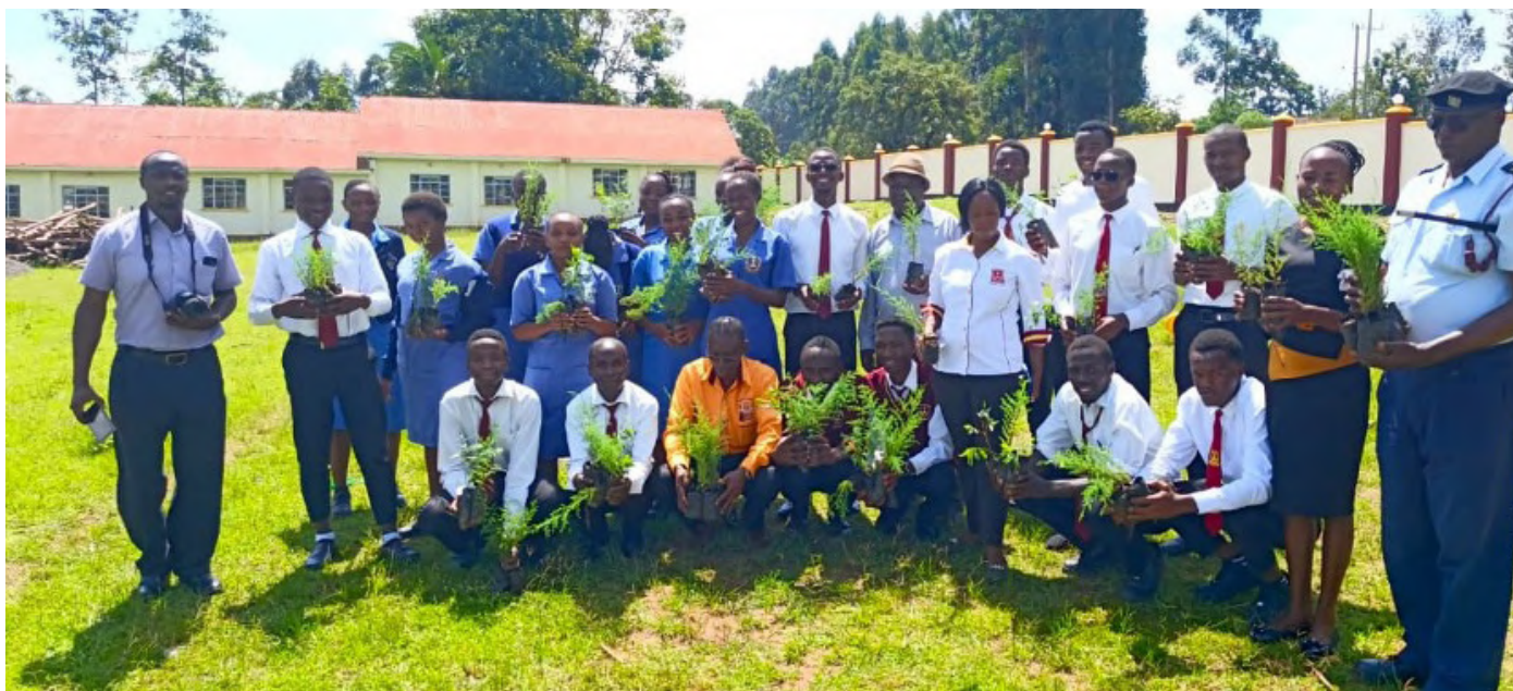
Members of the Webuye Campus President's Award Kenya Club, together with local authorities, participated in a tree planting activity as part of environmental conservation efforts.