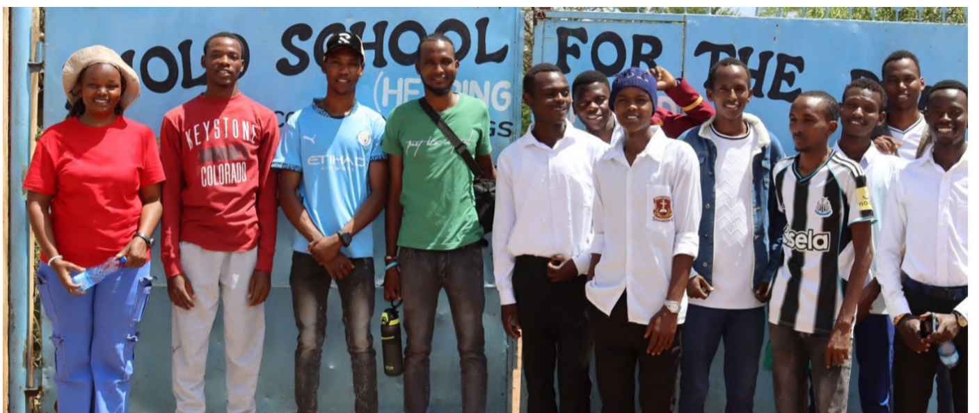
Isiolo Campus students and staff during a tree planting exercise at Isiolo School for the deaf on January 31, 2026, to celebrate World Wetlands Day.