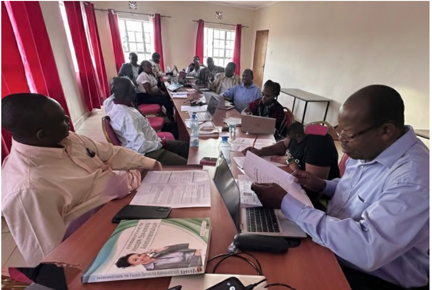
Participants review the module content as part of the course curriculum validation process.

A Diploma in Health Administration Management is in its final stages of curriculum development, marking a key milestone in enhancing healthcare leadership and management capacity in the country. The curriculum validation workshop was held over two days at KMTTC Yatta, beginning on January 21, 2026.