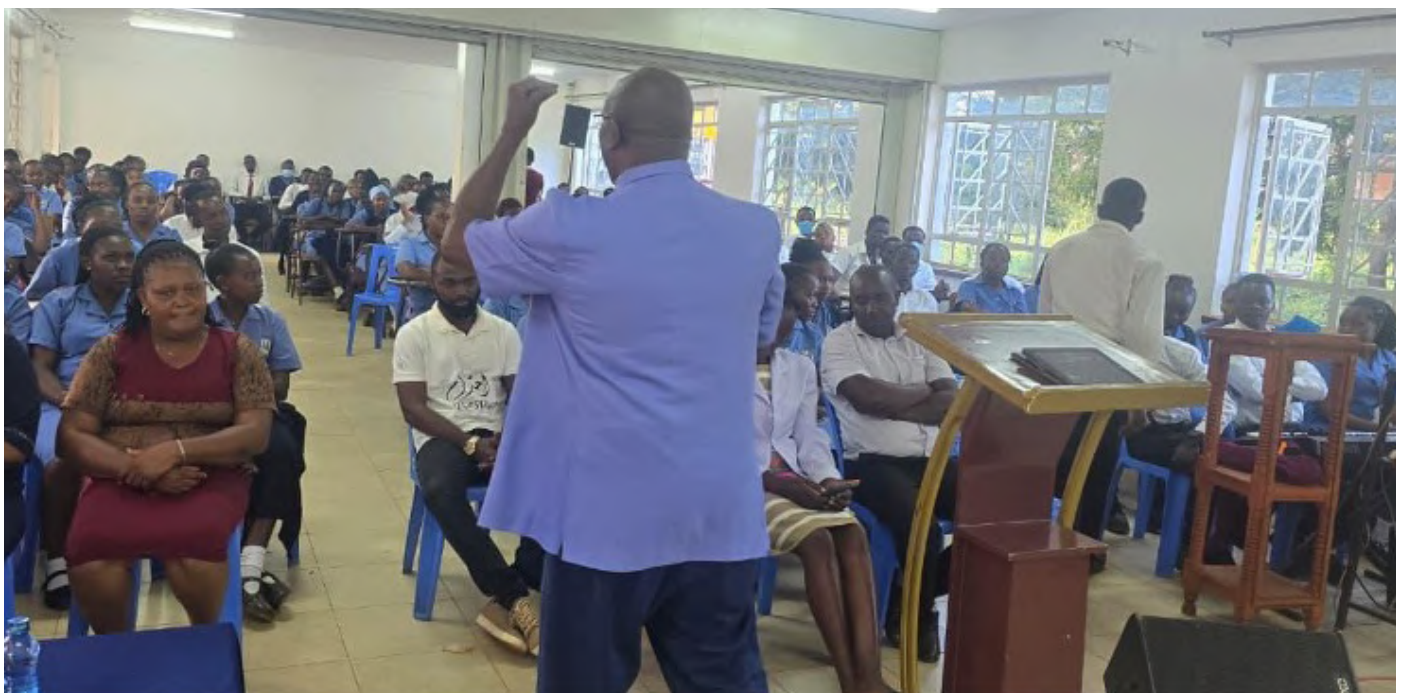
Makindu Campus staff and students during the FQE prayer day.