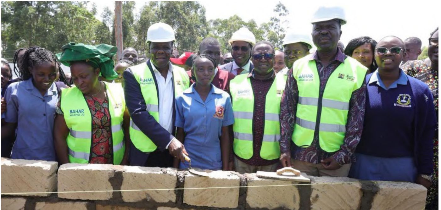
Co-operatives and Micro, Small, and Medium Enterprises Development Cabinet Secretary Hon. Dr. Wycliffe Oparanya (front row, 3 rd left) lays the foundation for the students' hostel.

Navakholo Campus hosted the national leadership, led by the Cabinet Secretary for Co-operatives and Micro, Small, and Medium Enterprises Development, Dr. Wycliffe Oparanya, as the campus celebrated three significant milestones aimed at transforming medical training and community healthcare in the region.