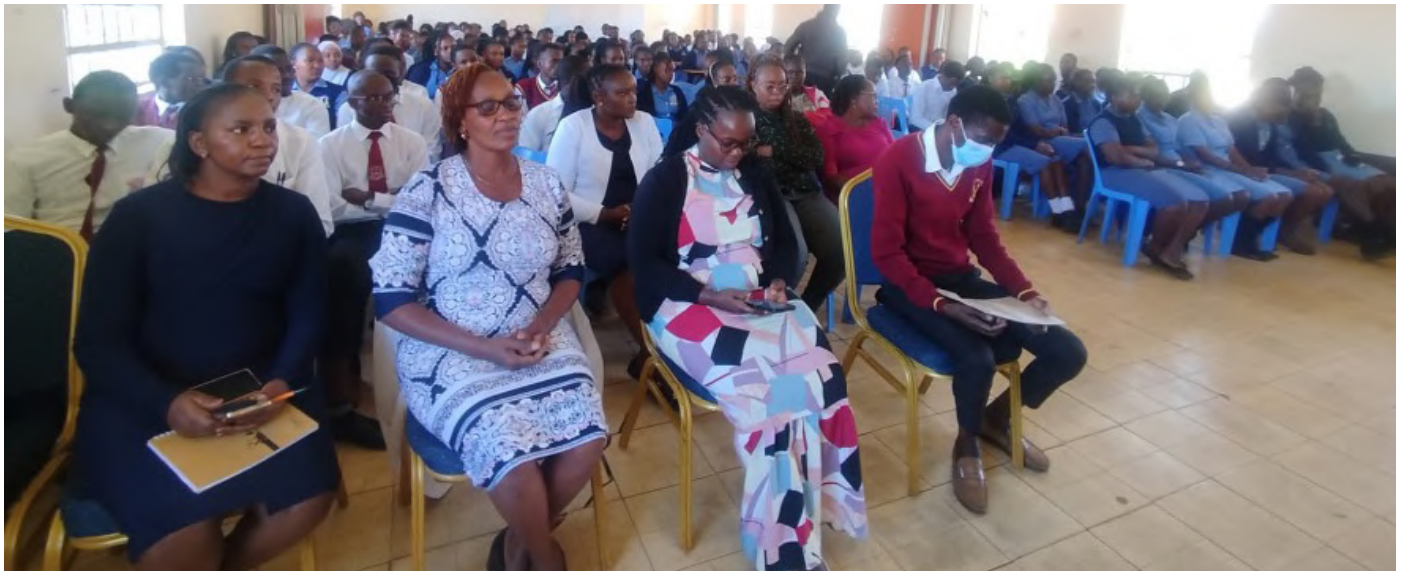
Gatundu- Mutunguru Campus staff and students during the FQE prayer day.