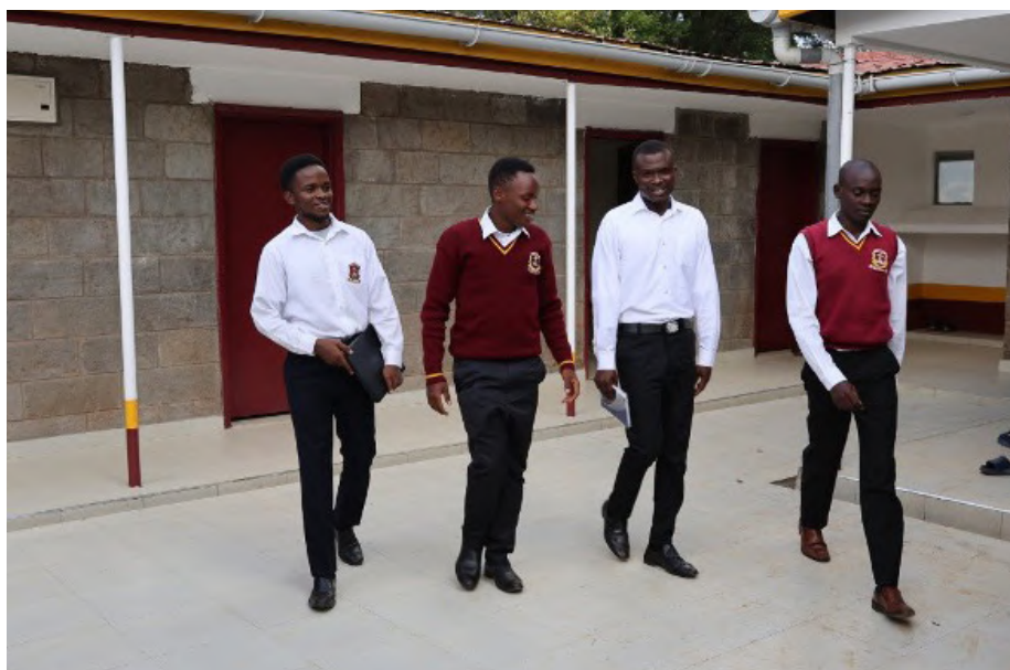
KMTC students enjoy some of the newly renovated infrastructure at the Karen Campus.

A spot check revealed intensive construction activity at several campuses.