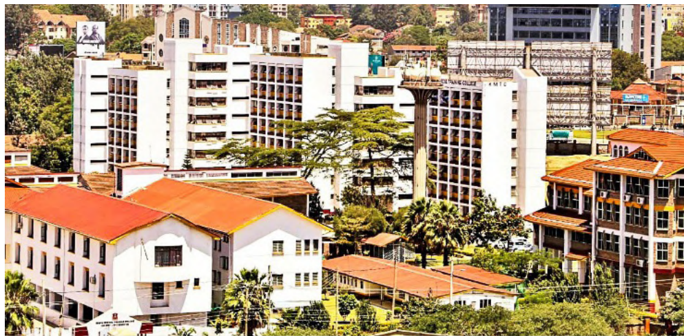
A section of the KMTC Headquarters and Nairobi Campus.