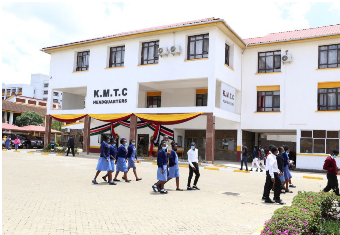
A Section of KMTC students.

The College is set to admit more than 24,000 learners in its March 2026 intake, marking one of the largest enrolments in the College's history and a major milestone in strengthening Kenya's healthcare workforce.