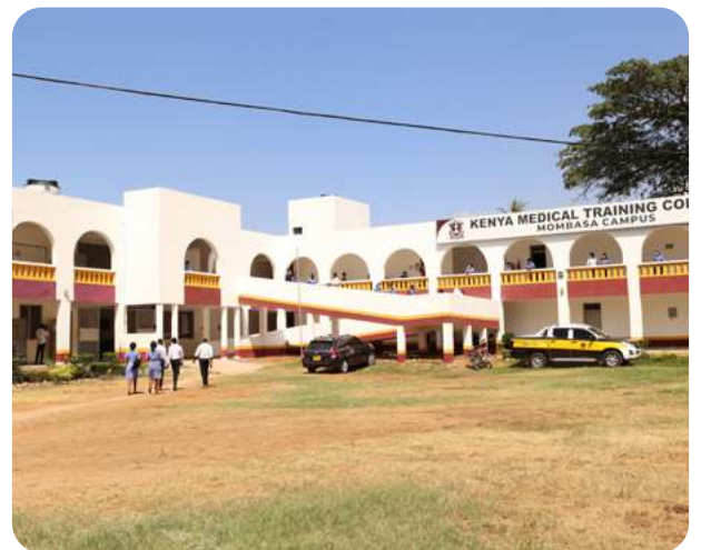
Mombasa Campus tuition block built through the support of Mvita CDF during Mombasa Governor Hon. Abduswamad Nassir’s tenure as the area Member of Parliament.