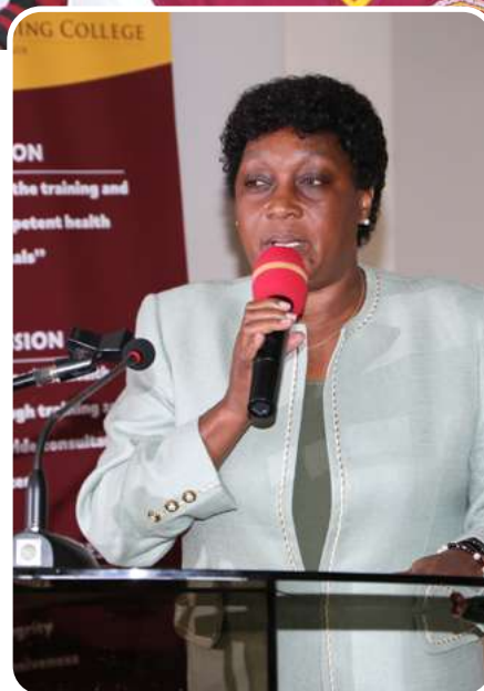
A section of students and faculty during the conference.

Their expertise and contributions shaped the discussions and provided valuable insights into various aspects of the healthcare field. In addition, 24 scientific papers were presented.