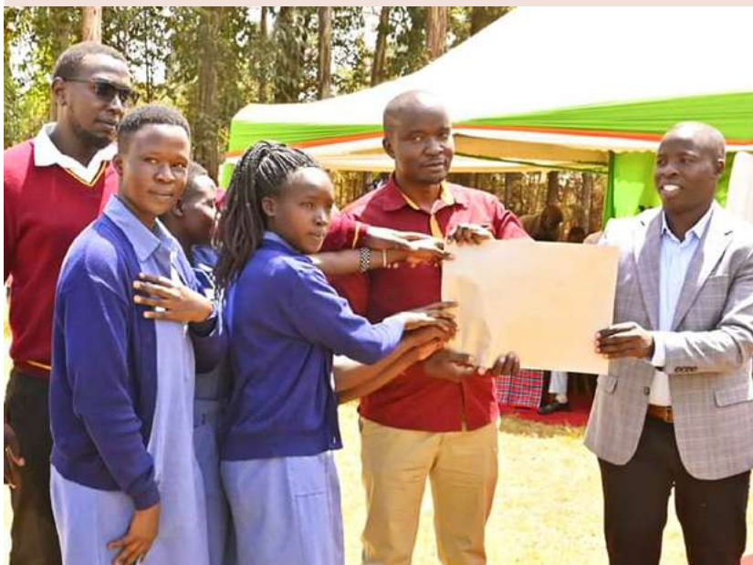
Nandi County Governor H.E. Stephen Sang (right) with a section of beneficiaries.

A total of 198 KMTc students are among beneficiaries of a Kshs. 60 million bursary allocation by the Nandi County Government to support their access to education.