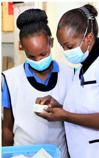
Students in a laboratory for a practical session.

In recent times, the College has been witnessing a remarkable surge in the enthusiasm and engagement of dedicated staff in the realm of research. This surge has manifested itself in a series of dynamic and enlightening activities that have left an indelible mark on our institution's pursuit of academic excellence and innovation.