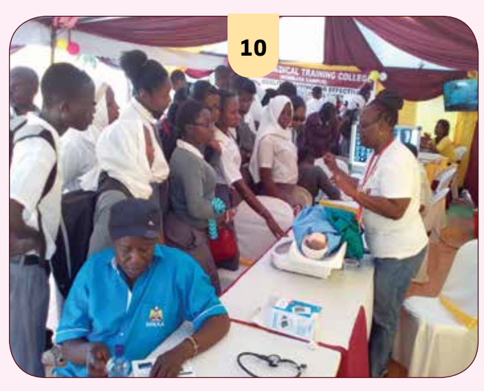
A staff member from KMTC Mombasa Campus explains to students courses offered in the College during the ASK Mombasa show.