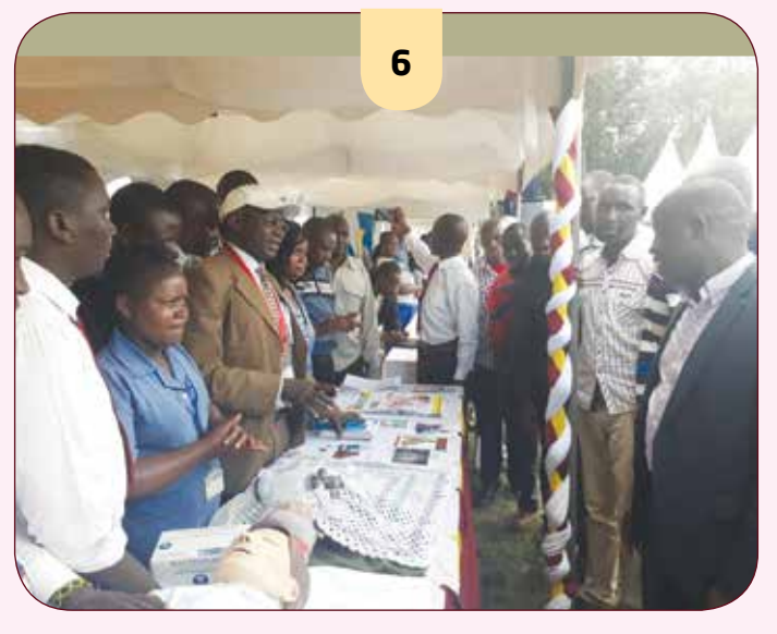
Nandi County Governor H.E. Stephen Sang visits the KMTC Mosoriot stand during an event to launch the implementation of the Big 4 Agenda in the County