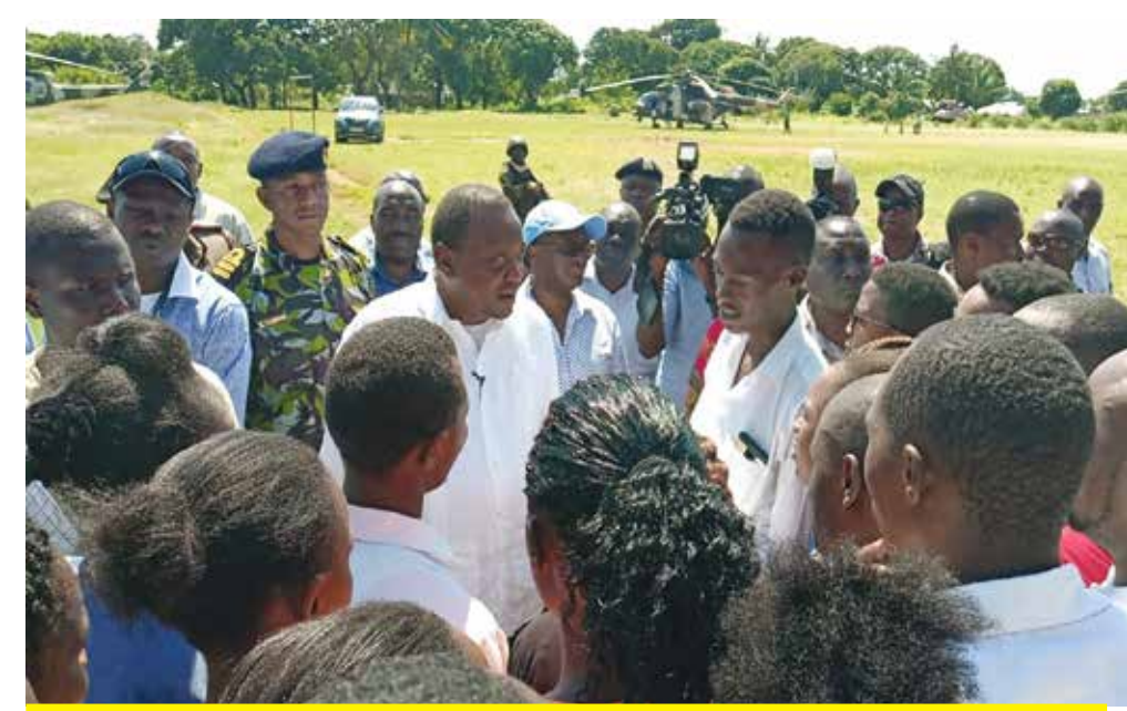
H.E. President Uhuru Kenyatta talks with KMTC Msambweni students during his visit to inspect development projects in Kwale County

The two new buses were bought by the World Bank, which sponsors the enrolled community nursing program in eight KMTC campuses, to ease transport of students to their clinical areas.