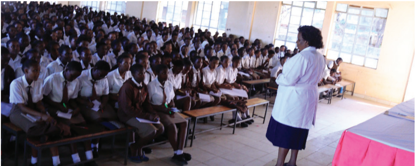
Makueni Campus during a meeting with Kambi-Mawe and Makueni Girls' secondary schools to publicize the College academic Programmes.