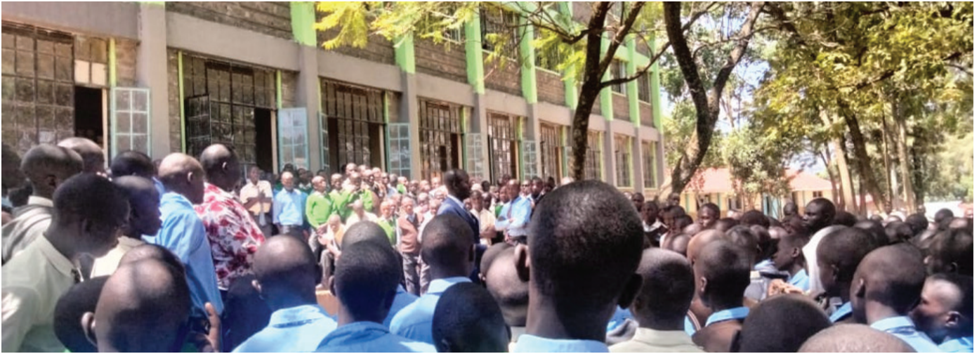
Lamu and Mombasa Campuses, participated in Lamu Career Day where they drummed support for KMTc programmes.