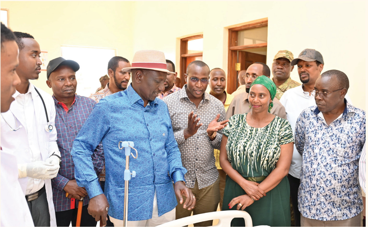
H.E President Dr. William Ruto with a host of leaders during his visit to Manderu Campus.