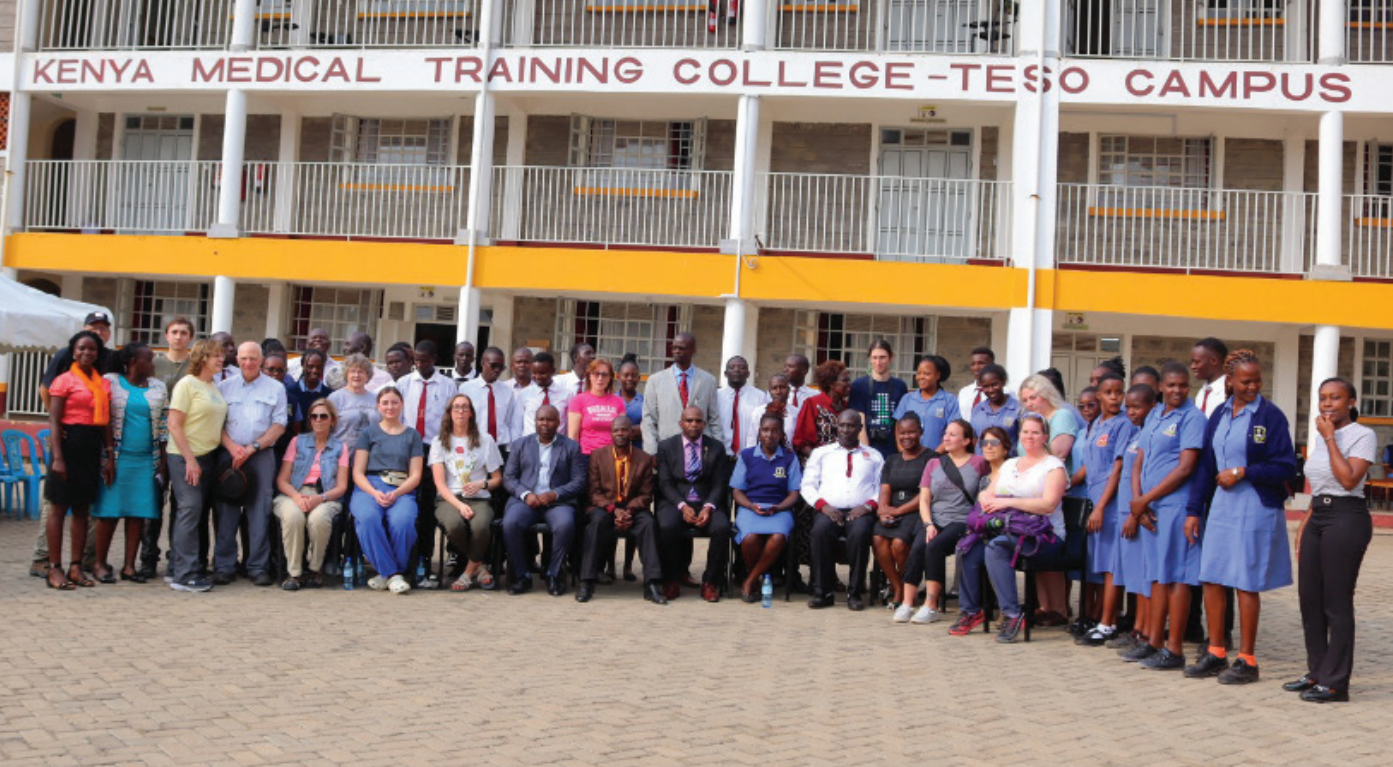
Staff, students and partners during the dental camp.