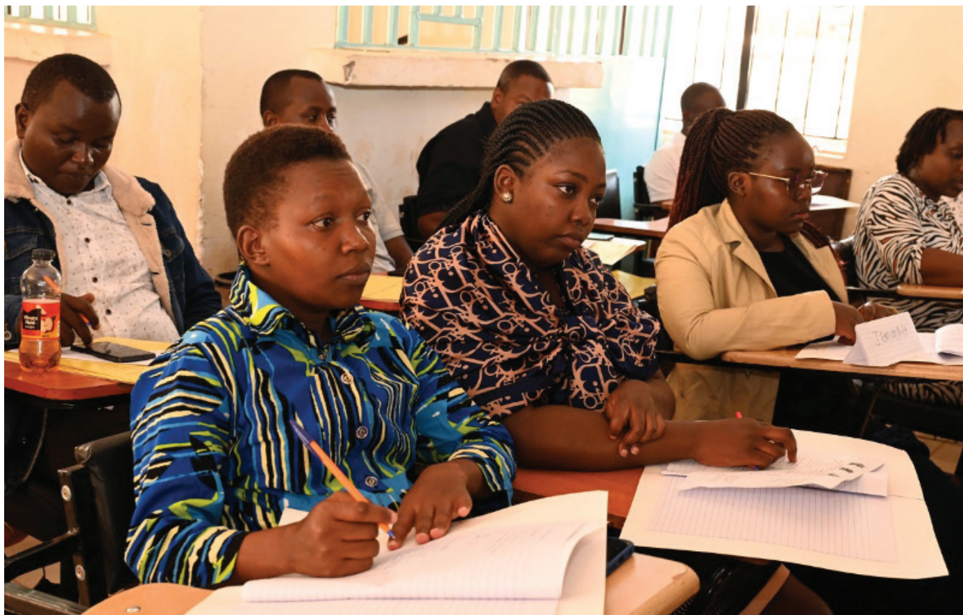
A section of the participants during the training.

College is making a significant step toward inclusive education by training over 150 officers to enhance learning for students with disabilities.