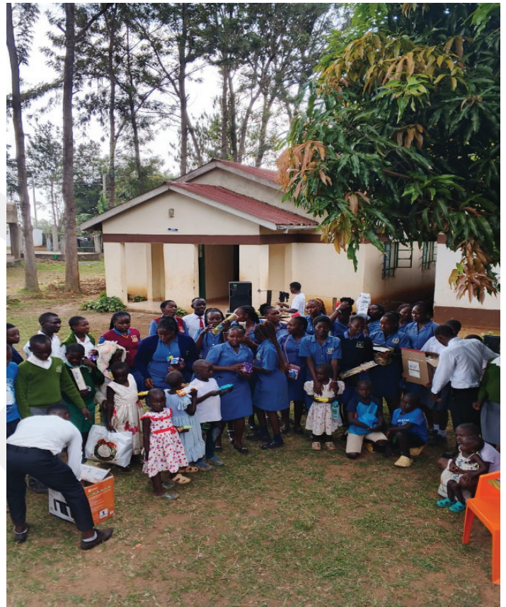
Rera Campus students visited the Ebenezer orphanage at Wagai where they donated clothes, personal effects, food and also shared a meal with the children.