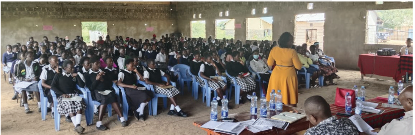
Mbooni Campus, accompanied by a KUCCPS official, participated in a Form Four Leavers Forum held at Kiundwani Secondary School in Ivingoni-Nzambani Ward, Kibwezi East Constituency (February 17, 2025).