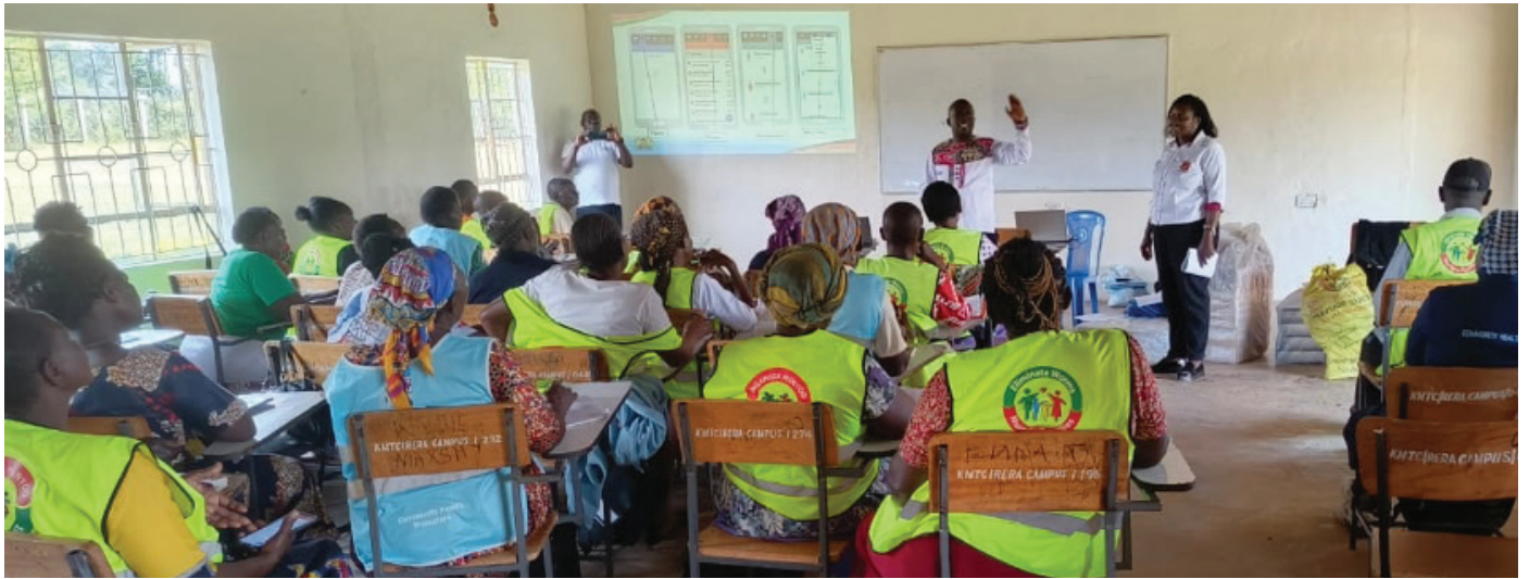
Rera Campus hosted an interactive session with Community Health Promoters (CHPs), providing them with insights into KMTc programs and the ongoing admission process.