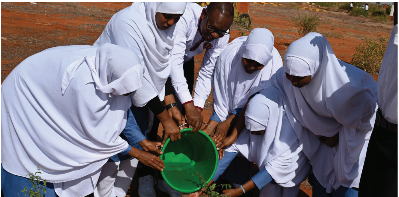
Mandera campus students plant trees (February 4, 2025).