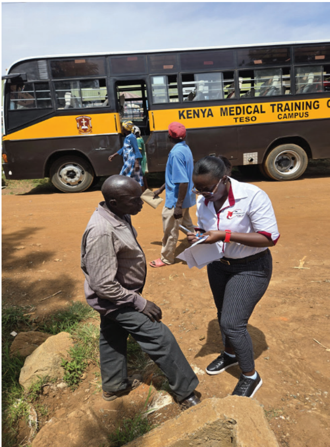
Teso Campus during a student mobilization exercise in the community.