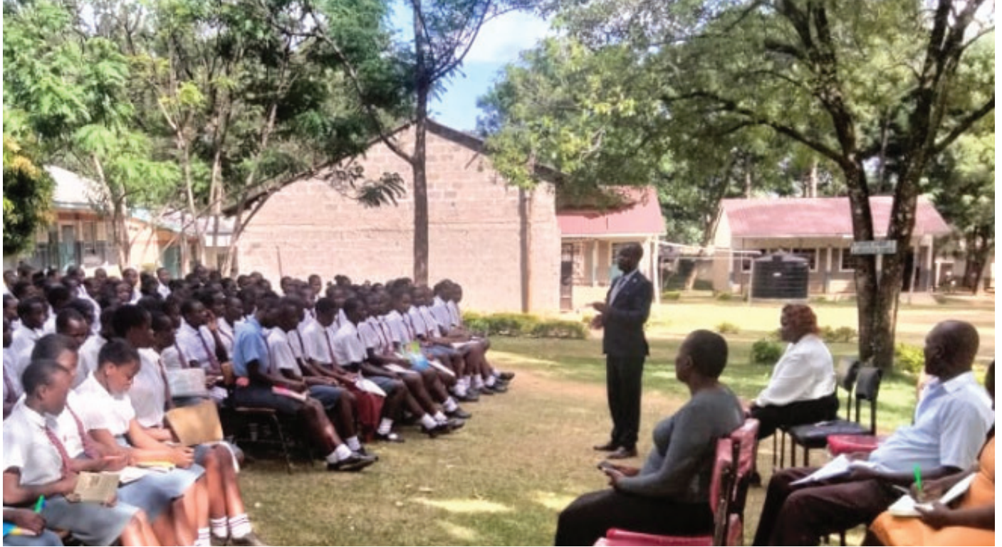
Chwele Campus during student mobilization at Kimukung Girls high school in Bungoma County.