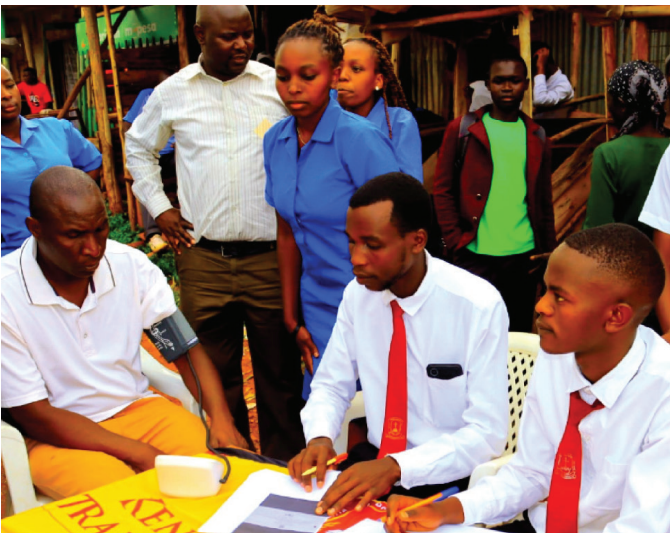
Nyamira Campus conducted a two-day student mobilization drive, and hosted an open day at the campus. As part of its Corporate Social Responsibility, the team incorporated a wellness activity, offering free BMI and blood pressure services to the community.