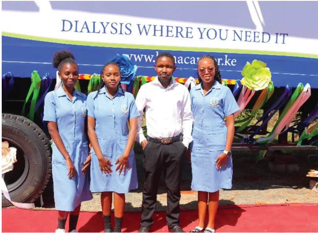
KMTC Murang'a students during the launch of Mobile dialysis at Kirwara Hospital Murang'a County on February 22, 2025. Through this initiative, the students will gain practical experience in dialysis procedures, patient care, and the management of kidney diseases - essential skills for their future medical careers.