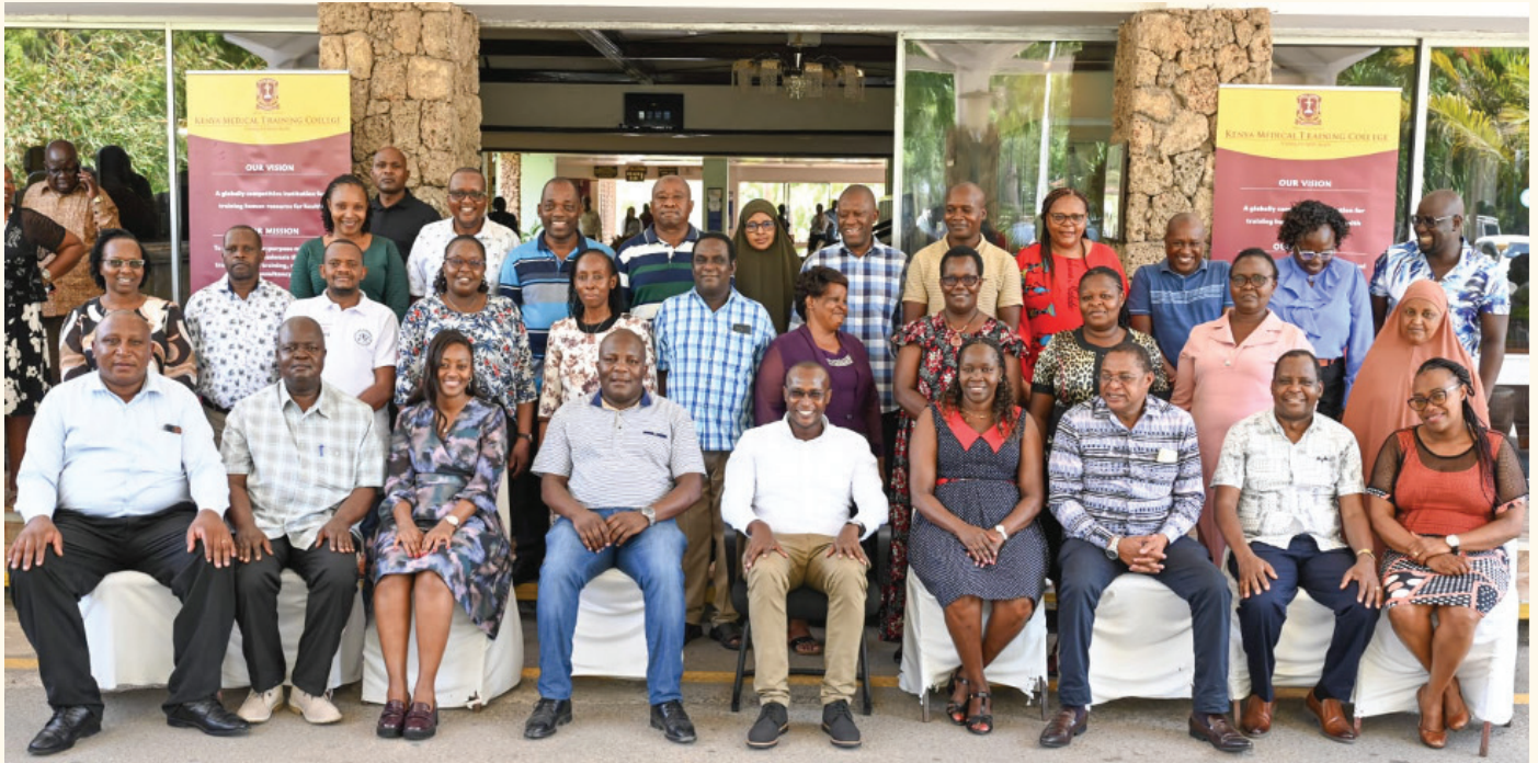
A section of the Management team and Principals during the workshop.

The College is set to train more than 5,000 Community Health Assistants across the country.