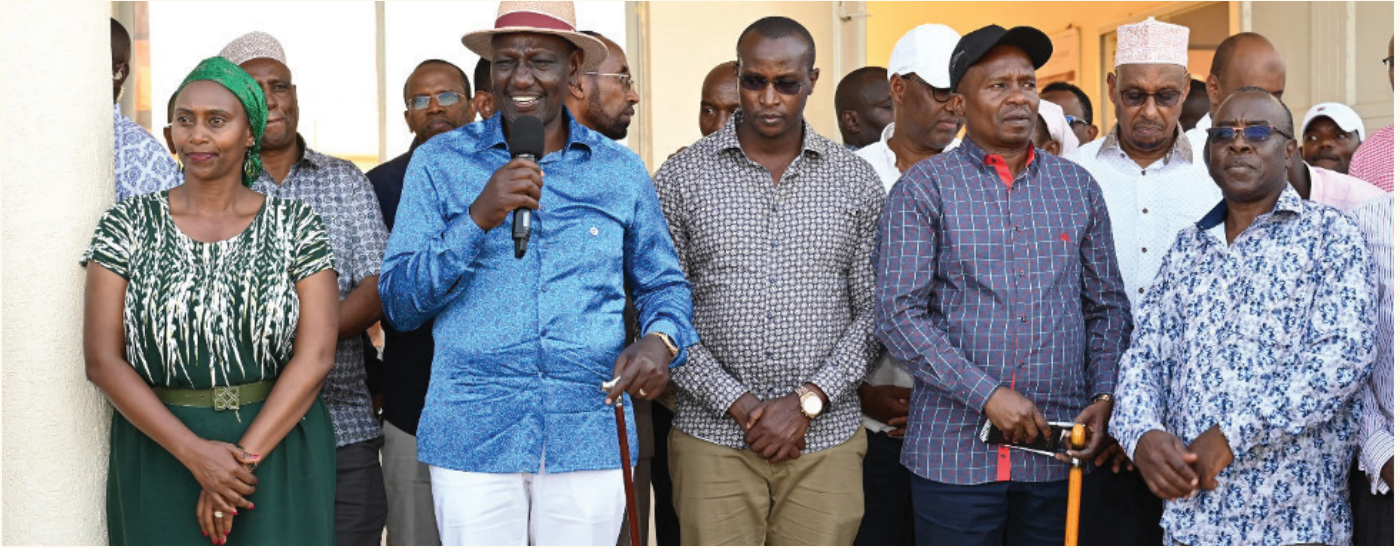
H.E President Dr. William Ruto during his visit to Mandera Campus on February 4, 2025.