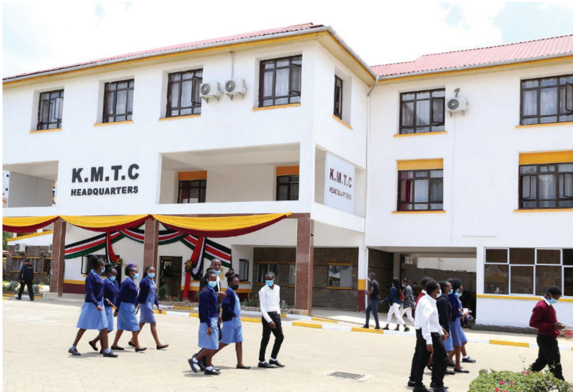
A section of the KMTC Headquarters.

T he College has reaffirmed its commitment to excellence, achieving a “Very Good” rating in the 2023/2024 performance contract evaluation.