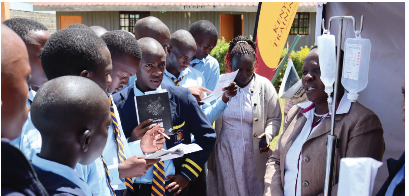
Nyandarua Campus held a successful Open Day aimed at mobilizing students for the upcoming March 2025 intake.