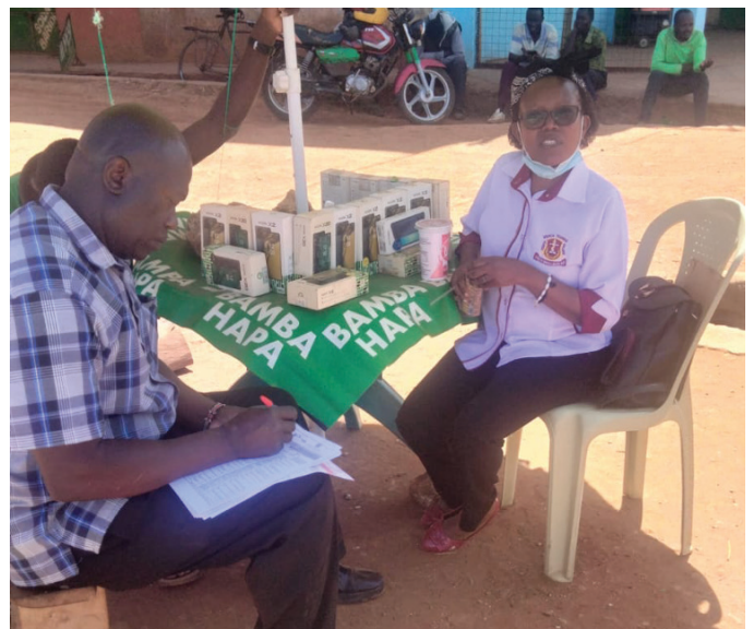
Chwele Campus conducted a successful student mobilization drive at Chwele Market, engaging potential applicants and creating awareness about available courses.