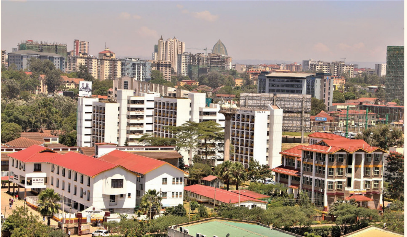
A section of the KMTCC headquarters and Nairobi campus.

W hen the College launched its Mortuary Science program in March 2023, few could have predicted its rapid rise to becoming one of the College’s most sought-after courses.