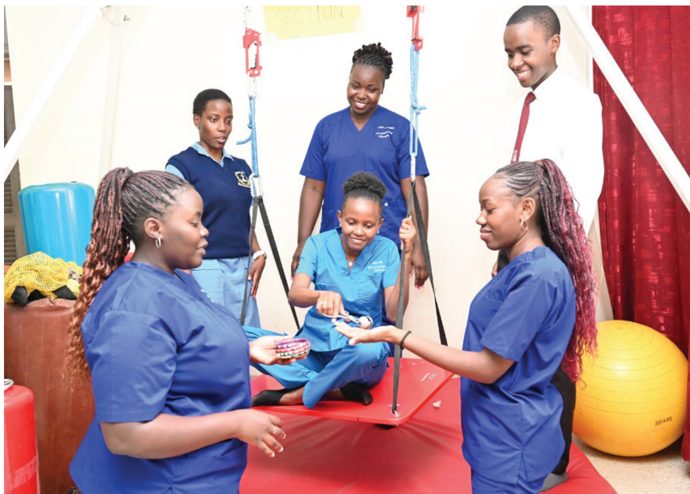
KMTC Occupational Therapy students during a practical session to enhance their skills.

T he College has announced 22,070 training slots for the March 2025 intake. The courses offer aspiring healthcare professionals an opportunity to pursue quality medical education.