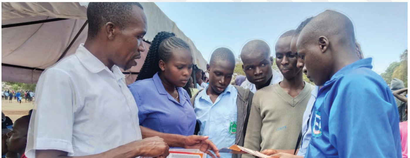
Homa Bay Campus at Oriwo Boys High School in Karachuonyo for student mobilization.