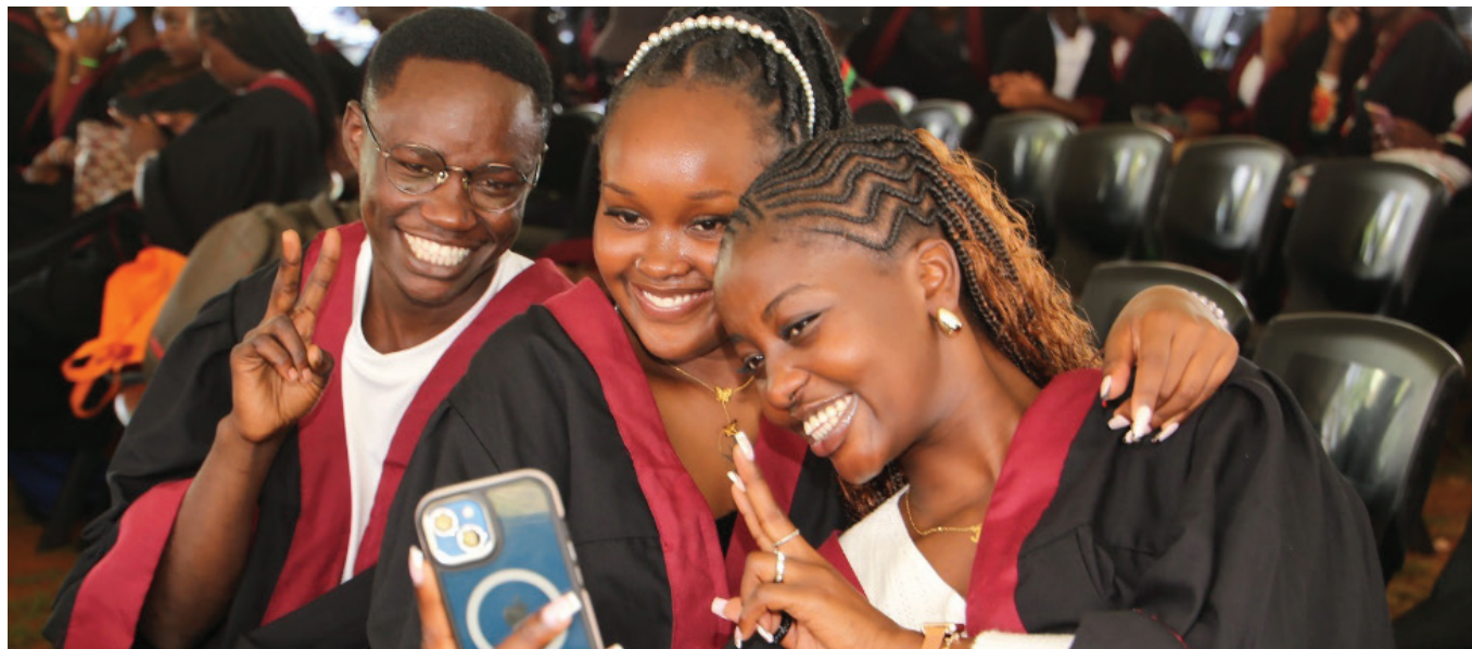
KMTTC Graduands during a past graduation ceremony.

He also noted the high regard for KMTTC graduates, who are recognized for their competence and skills. The sign-