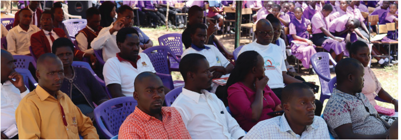
Kisumu Campus during a student mobilization exercise.