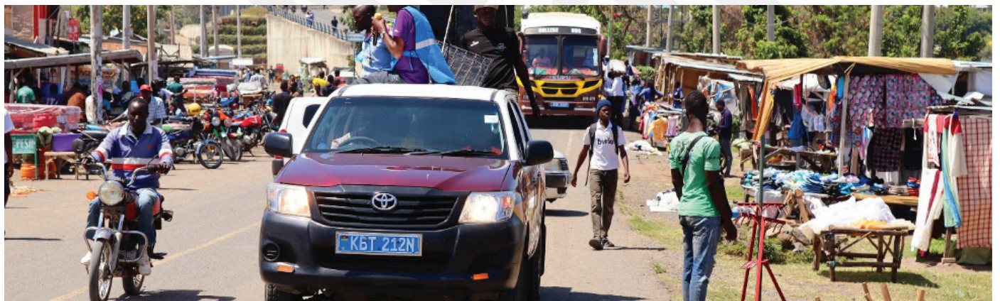
A roadshow organized by Rachuonyo, Ndihiwa, and Homa Bay campuses during student mobilization campaigns.