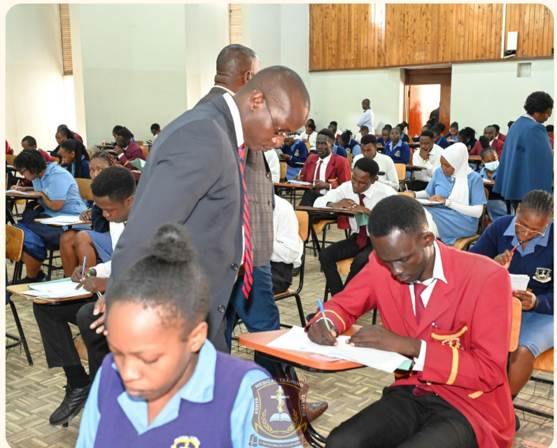
KMTCC CEO Dr. Kelly Oluoch interacts with Nairobi Campus students during their Final Qualifying Examination (4 July, 2024)

The visit underscores KMTCC's commitment to supporting its students and maintaining high standards of education and examination integrity.