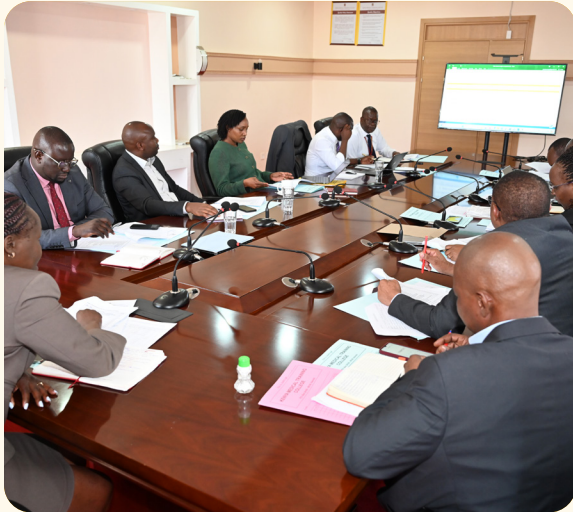
The College Budget Committee during a meeting at the headquarters on 8 July, 2024.