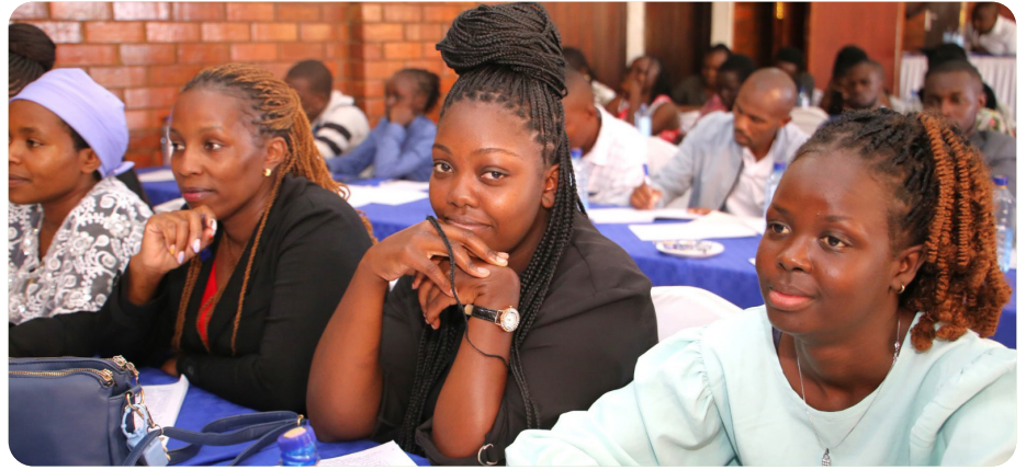
A team of cohort 3 of newly recruited staff members during an induction training session in Mombasa

After successfully recruiting over 400 new employees across various departments, the College is now organizing the third phase of its induction training program for the newly appointed staff. This training follows the first two sessions held in Mombasa from November 13-17, 2024 and in Kisumu from June 3-14, 2024. The upcoming training is scheduled to take place in Mombasa from July 15 to 26, 2024.