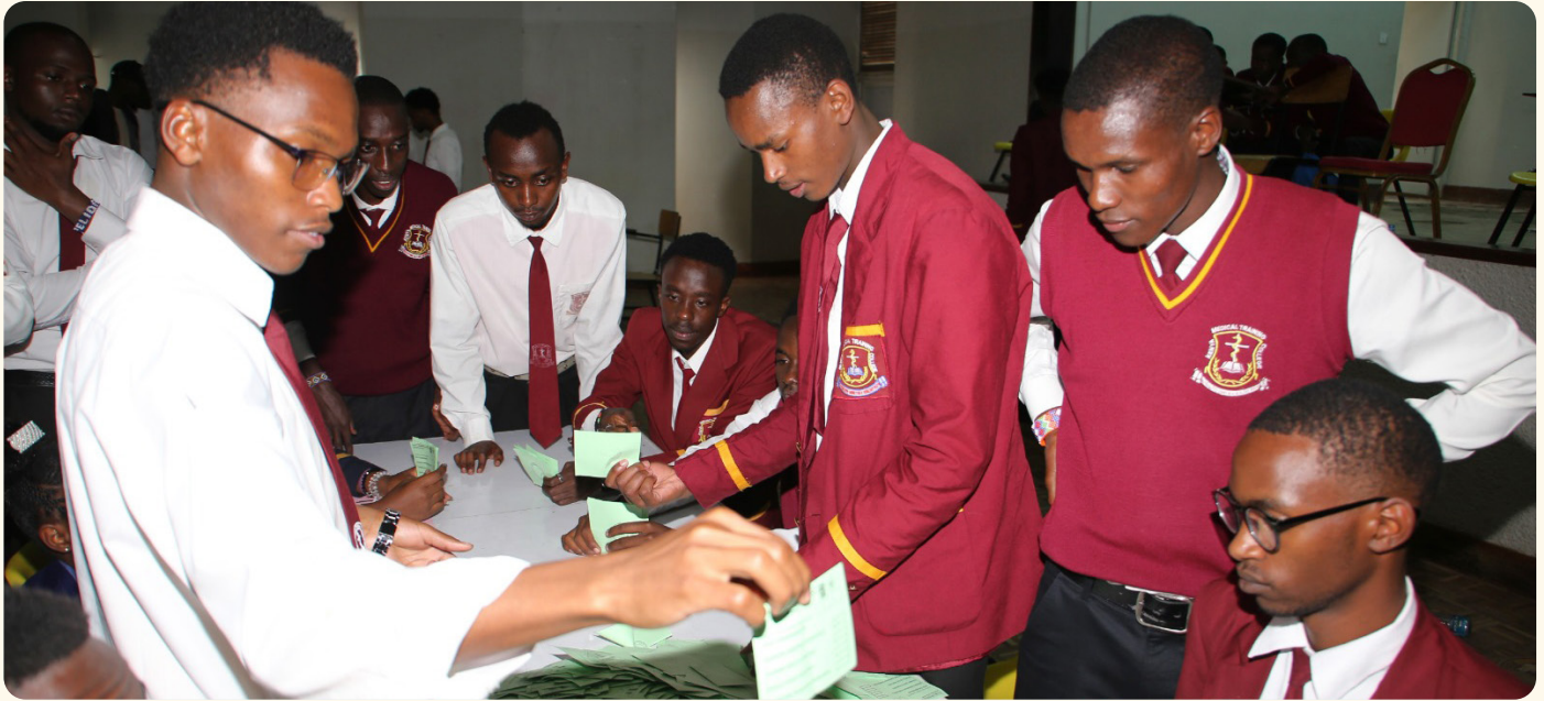
Tallying of votes at Nairobi Campus during the Students Representatives Council (SRC) Elections 2024/2025.

The College recently completed its Students' Representative Council (SRC) elections across all campuses for the Academic Year 2024/2025, marking a significant step towards fostering student leadership and representation within the institution. The electoral process, conducted from March to May, began with the declaration of vacant positions, followed by a thorough vetting of candidates and vigorous campaign activities lasting one to two weeks.