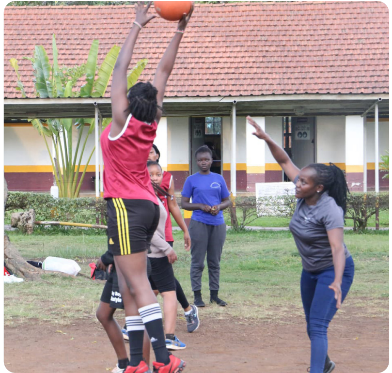
Nairobi Campus Netball team gearing up for the National Competitions.

The upcoming national sports competition promises to be a thrilling display of talent and determination, where KMTC athletes will strive to achieve their best and uphold the college's tradition of sporting achievement.