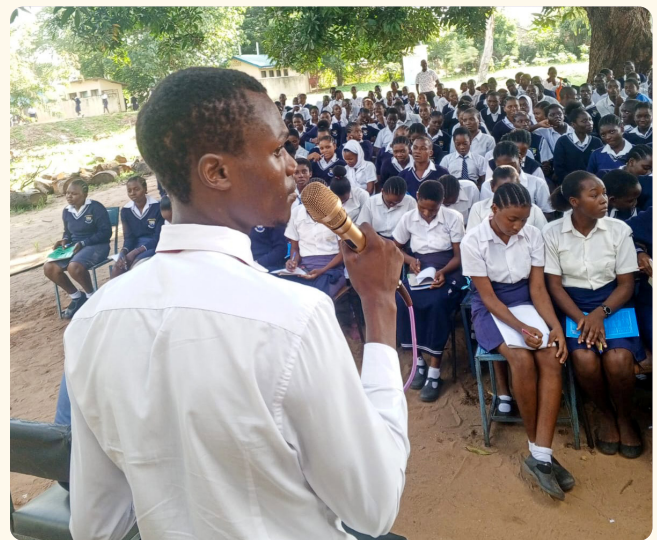
A KMTC student addressing Ngala Mixed Secondary School pupils.

In an inspiring move to educate future healthcare professionals, the Kenya Medical Training College (KMTC) Kilifi Campus organized a sensitization session at Ngala Secondary Mixed School in Kilifi County on July 9, 2024. This initiative aimed to provide essential