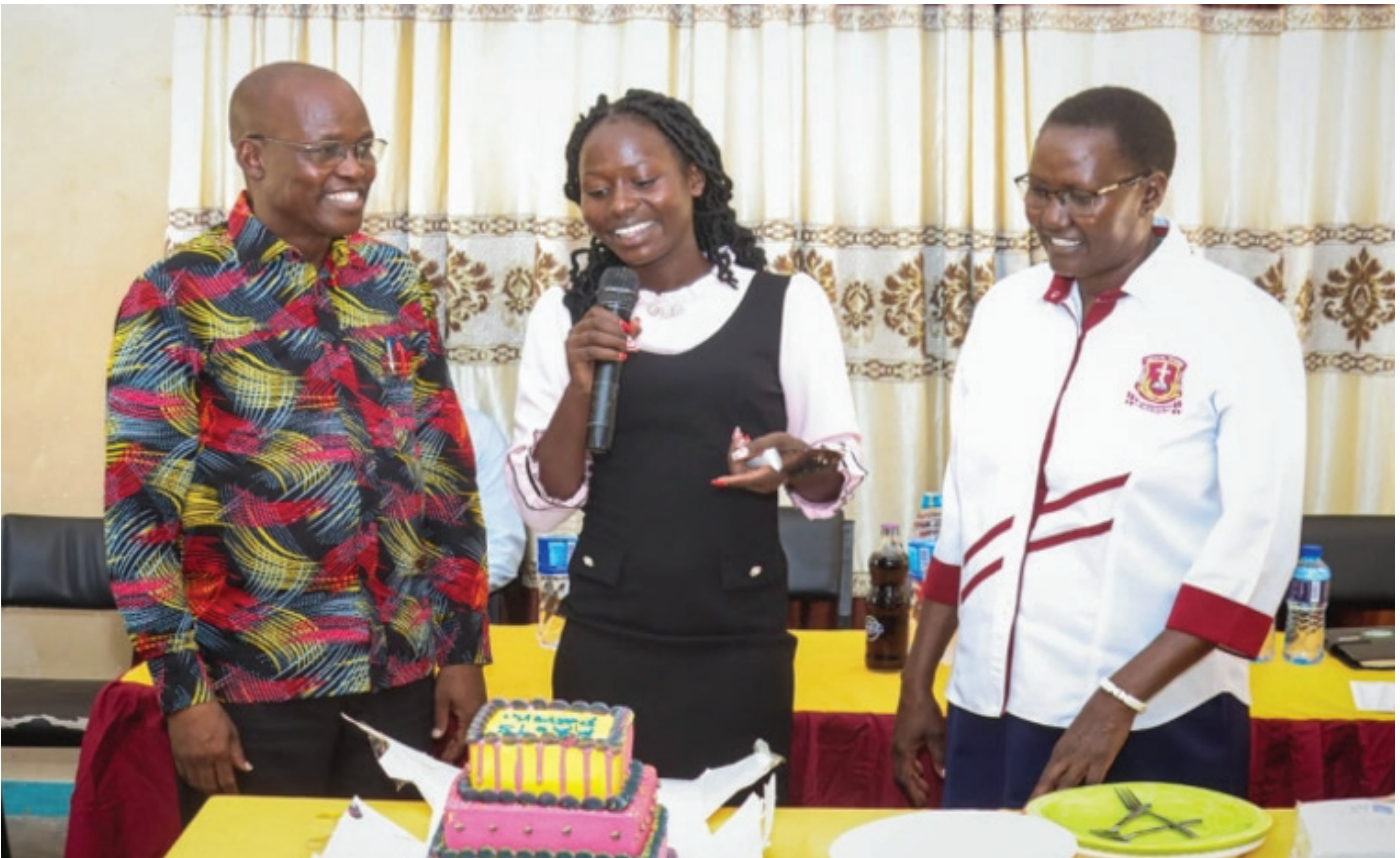
Turkana County Governor Hon. Jeremiah Lomorukai (left) during a courtesy call to KMTCLodwar Campus. He pledged his continued support and emphasized the role of education in societal advancement, empowering individuals to thrive and contribute meaningfully to the world.