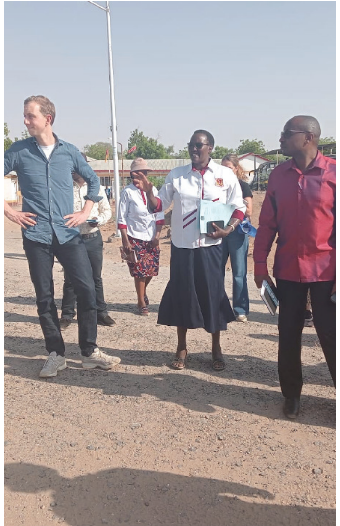
Lodwar Campus hosted the UNHCR team and donors on January 21, 2025. The team held discussions on the transformative student scholarship programme and key projects in the Campus.