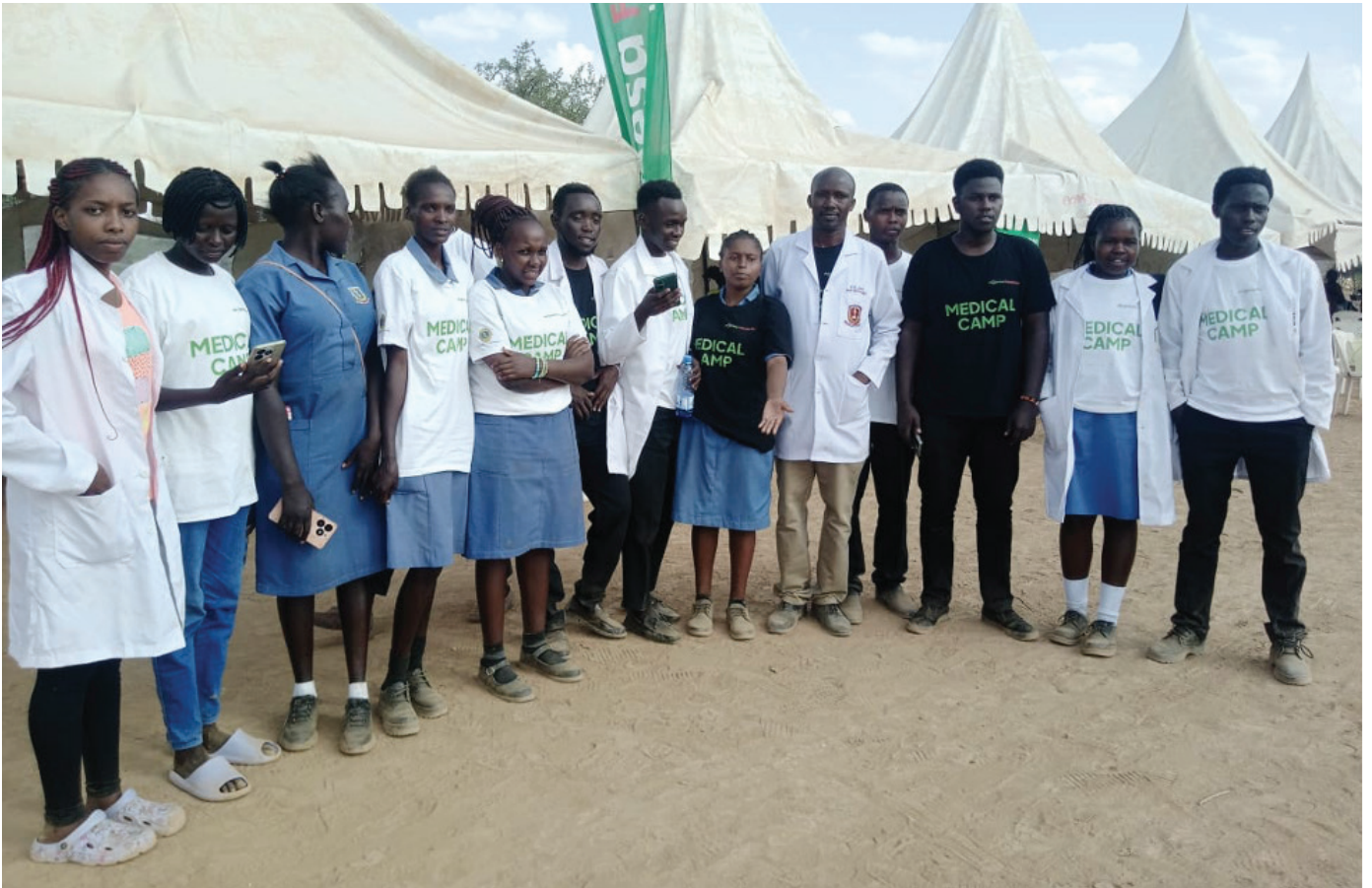
Chemolingot students and staff on January 26, 2025 participated in a free medical camp sponsored by Safaricom Mpesa foundation in conjunction with the health services department of Baringo county.