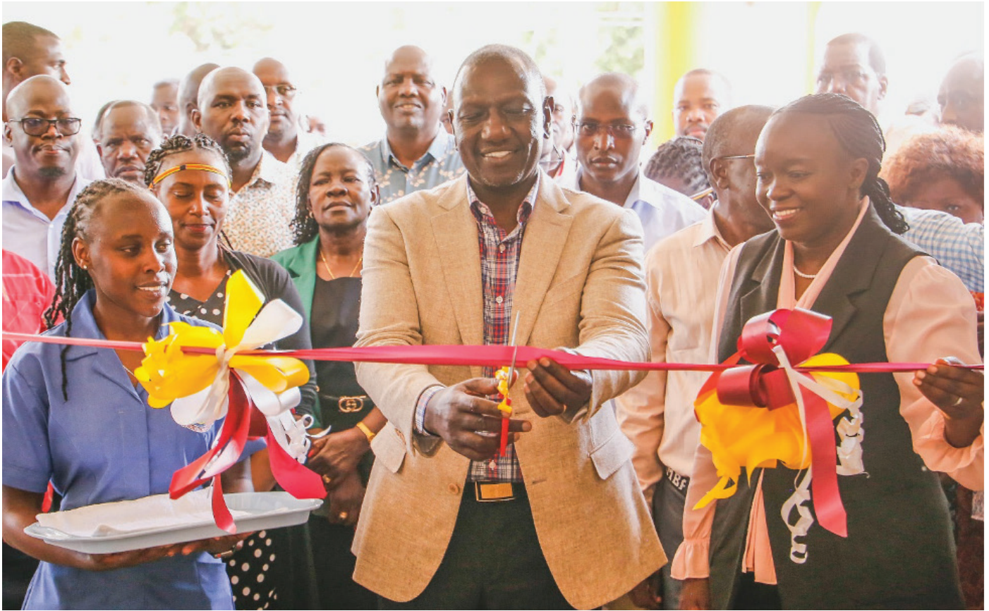
President William Ruto during the commissioning of Kerio Valley Campus.