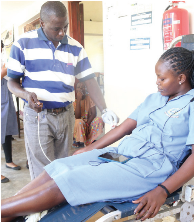
On January 17, 2025, Lamu Campus staff and students demonstrated their commitment to saving lives by participating in a blood donation drive.