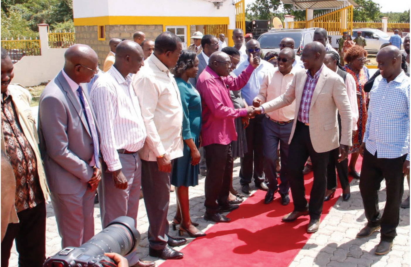
President William Ruto being received at Kerio Valley Campus.