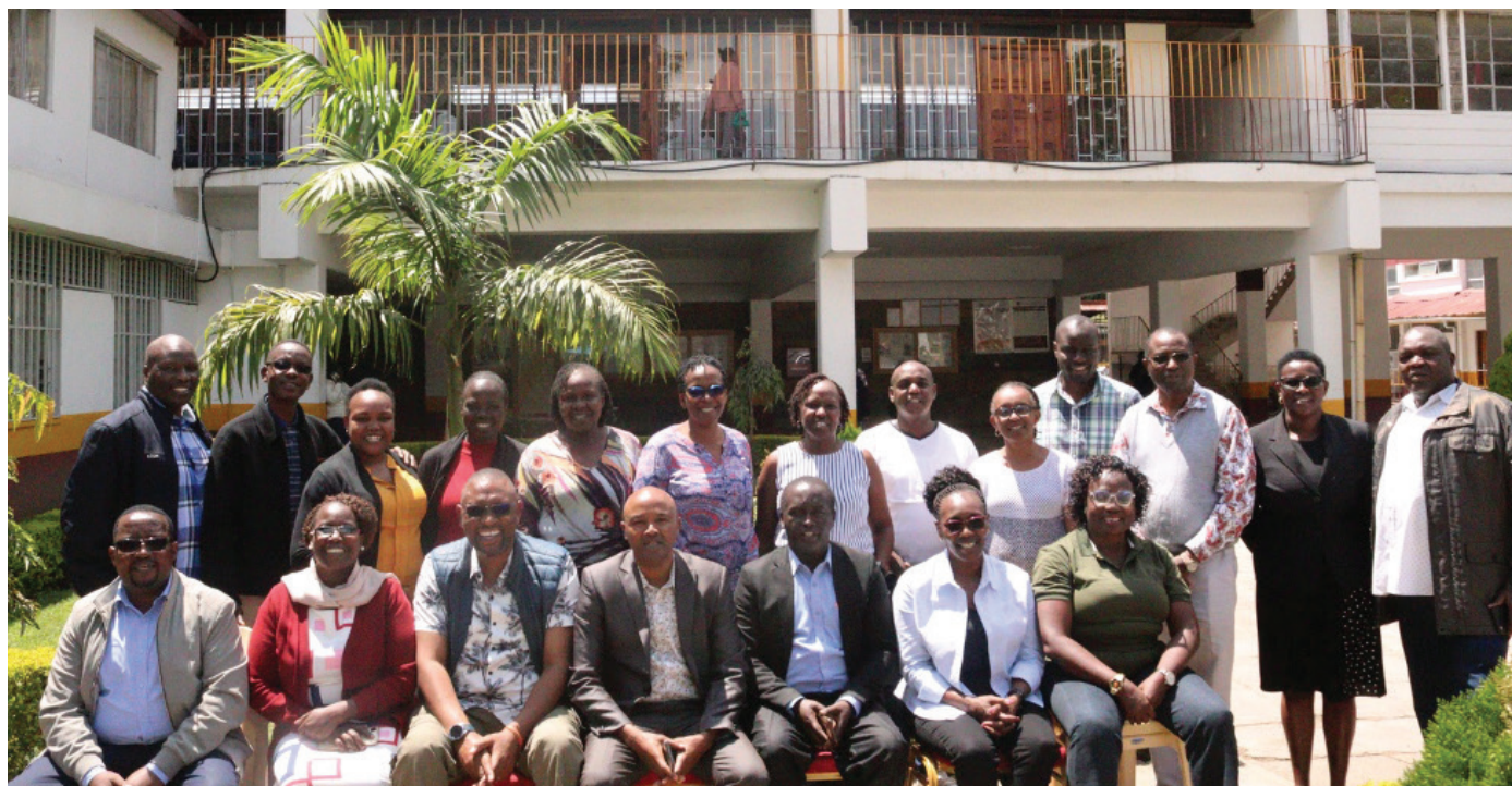
Participants during the workshop in Nakuru.

For many researchers, the journey from discovery to implementation is often hindered by one major challenge, the inability to translate research findings into effective policy briefs. Without clearer, concise, and actionable summaries, groundbreaking research risks gathering dust instead of shaping real-world solutions.