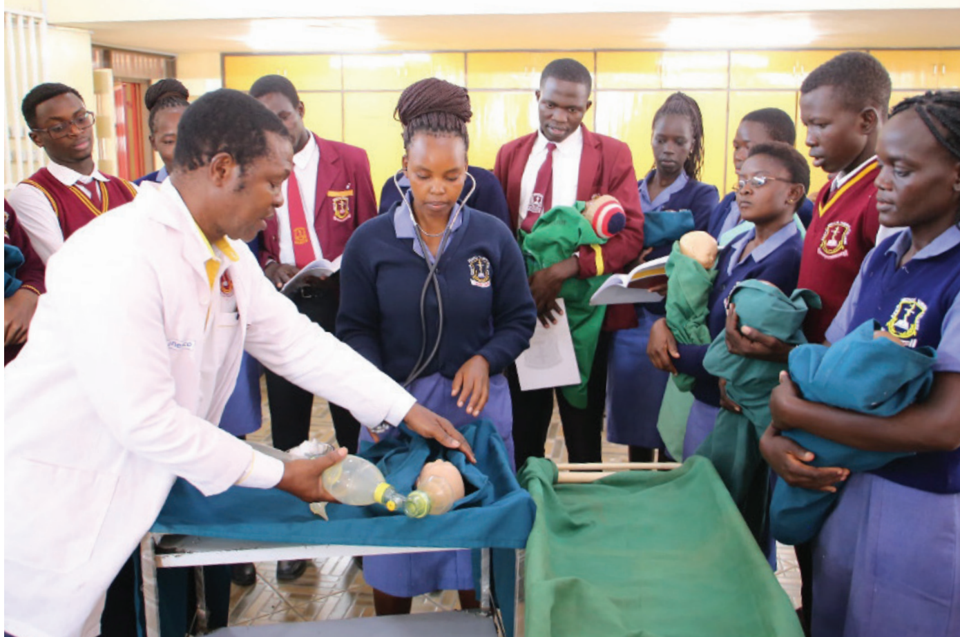
KMTTC Students and their lecturer during a clinical demonstration.

T he College through the Ministry has initiated discussions with the government to reinstate Higher Education Loans Board (HELB) funding for its students.