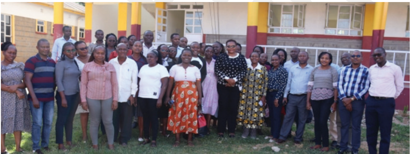
As part of the government's transition from a two-tier to a three-tier HIV testing algorithm, KMTCC Mbooni hosted healthcare workers from various facilities in Mbooni Sub-County on January 21, 2025. The training aimed to equip them with updated knowledge and skills to enhance HIV testing and diagnosis.