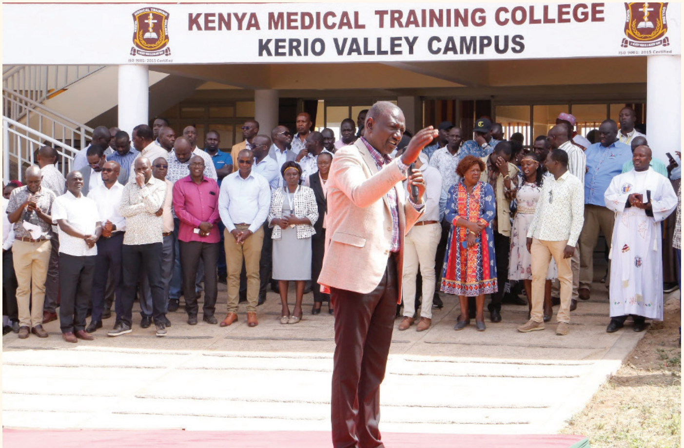
President Dr. William Ruto at Kerio Valley Campus.

The College is set to receive Kshs 600 million from the National Treasury to recruit additional staff and strengthen health training in the country.