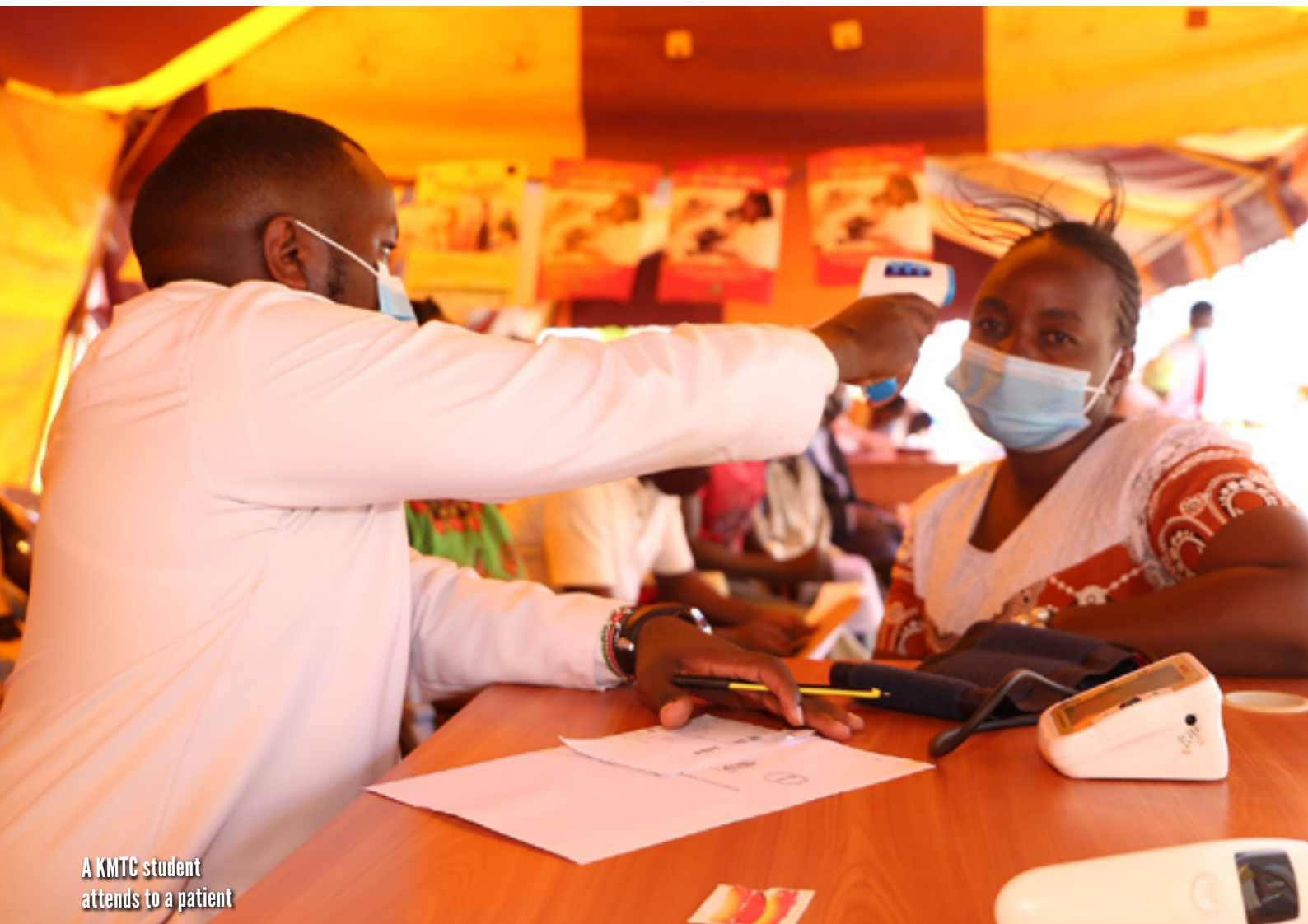
A KMTC student attends to a patient

T he College held a free medical camp at KMTC Taveta Campus in Taveta Constituency, Taita Taveta County, from 22 nd to 24 th June, 2021.