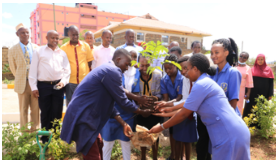
File Photo: 2022

On its part, Bungoma Campus commemorated World Environmental Day by planting tree seedlings as part of efforts to accelerate achievement of the 10% country's tree cover