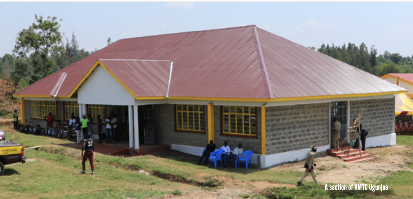
A section of KMTC Ugunjaa