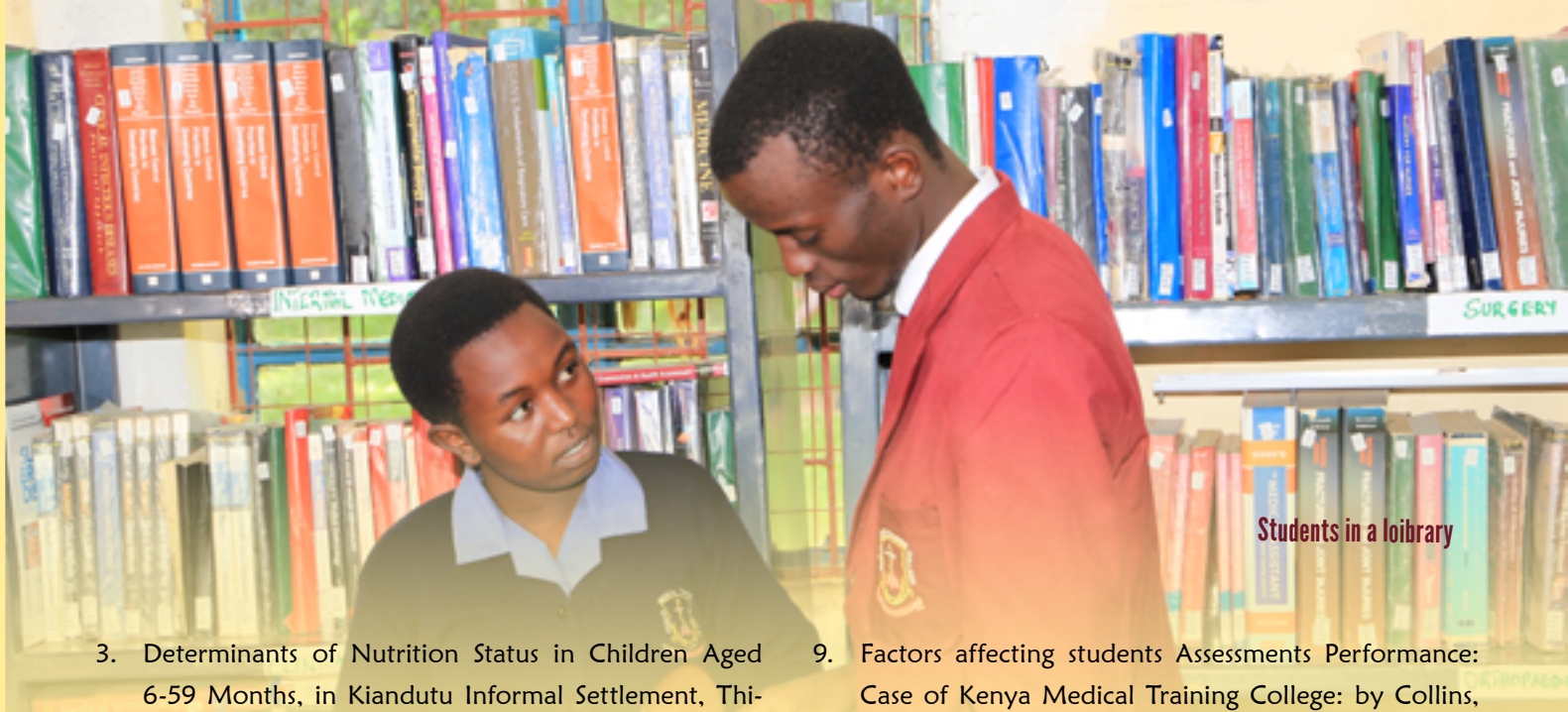
Students in a library