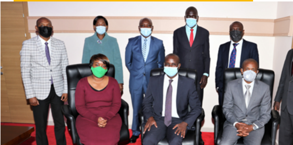
KMTC Deputy Director Finance, Planning and Administration (seated center) during a partnership meeting with a delegation from Safaricom Plc. and Valley Land Shelters & Properties Ltd.

T he College is eyeing a new strategic partnership with Safaricom Plc to expand access to eLearning.