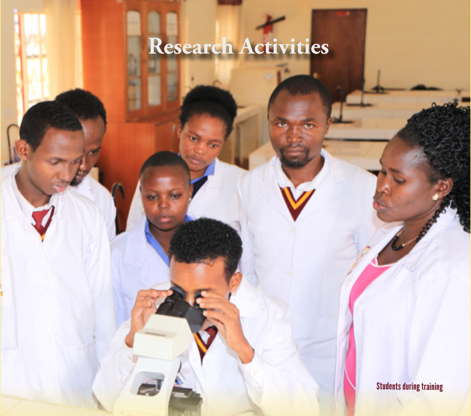
Students during training

T he College has committed to undertake various research activities in a bid to drive innovative national policies towards coordinated Health response and enhance delivery of its training, research and consultancy mandate. This is especially critical with the emergence of global pandemics such as the COVID-19, that continually arise in the dynamic health sector. Recognizing that research and training are a key component of scaling up services, the College is leveraging on its internal capacity to engage global counterparts, developers and manufacturers to strengthen research ability. Towards these efforts, the Board has continued to allocate funds to encourage uptake of research activities. In the period under review, the College published 14 research studies, while four were conducted and eight approved for funding.