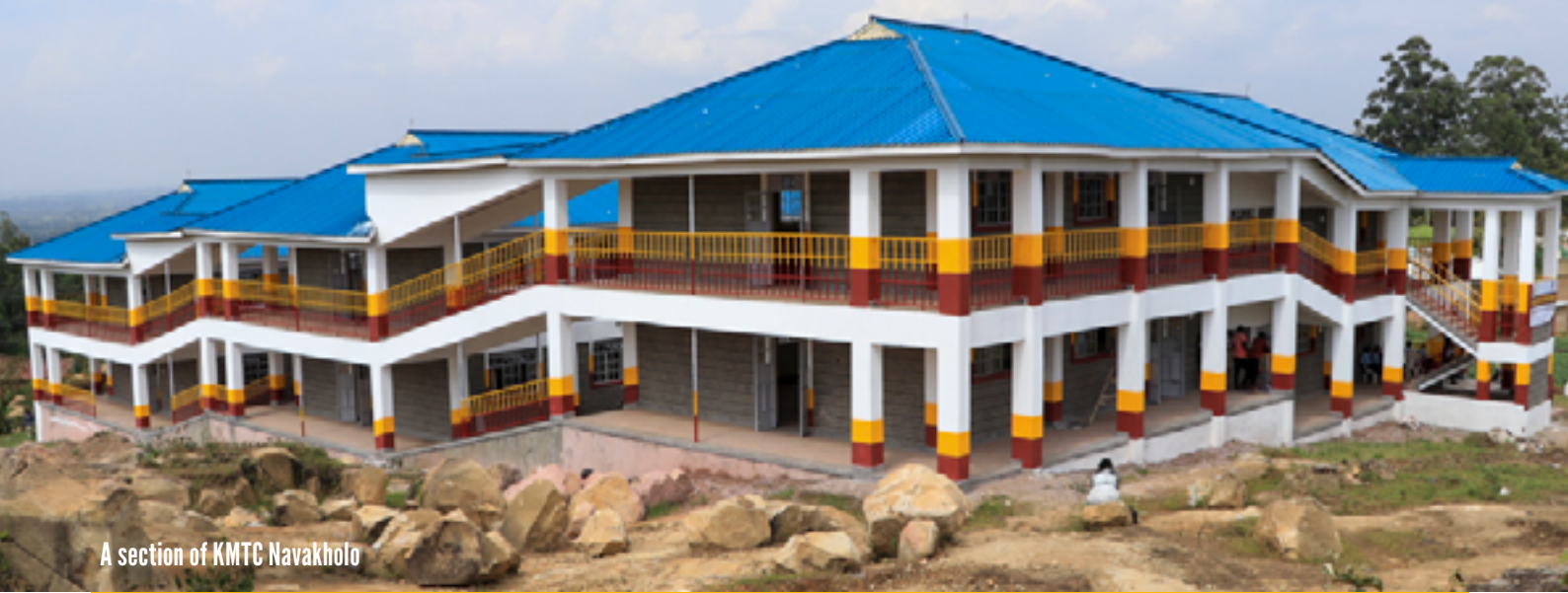
A section of KMTC Navakholo

The College has in the recent past attracted strategic partnerships, recording massive investment and growth in infrastructure.