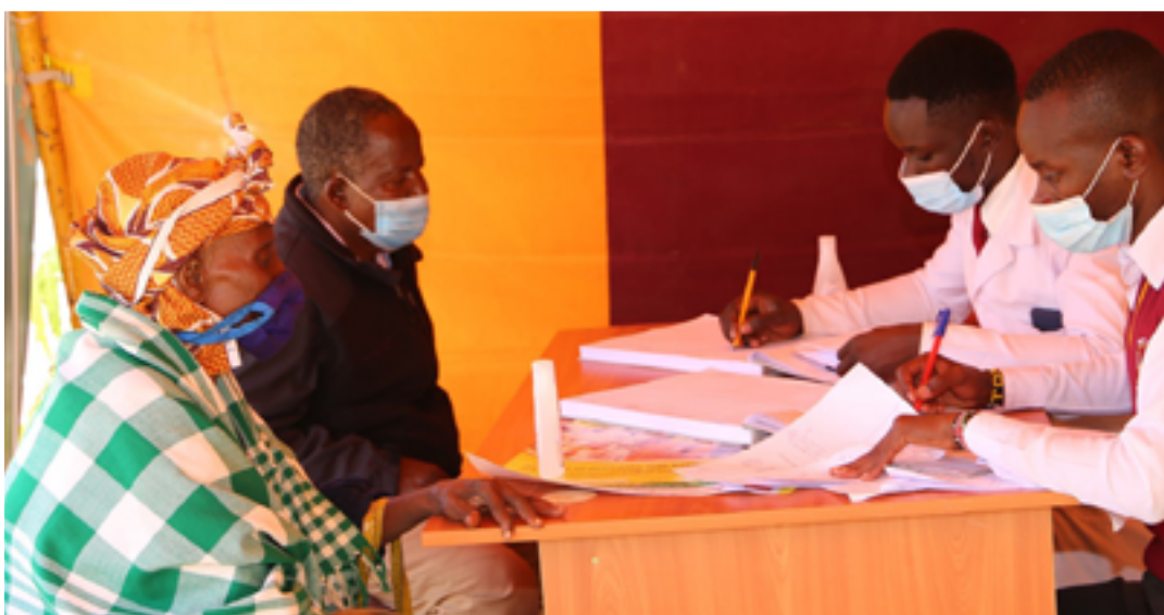
KMTC Students attend to patients during the medical camp

Prof. Kiptoo revealed that the College continues to attach students to rural health facilities, a move aimed at reducing the burden of treatment emanating from late disease diagnosis.