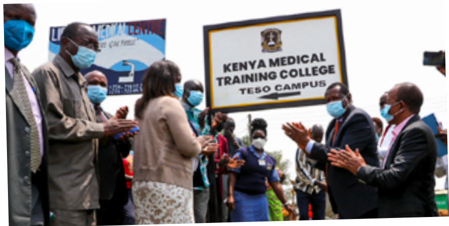
KMTC Board Directors, area Mp. Hon. Kaunya, Busia County and Teso North NG-CDF officials during a visit

Busia County Governor Sospeter Ojaamong welcomed the project, saying it will go a long way in strengthening the county's health-care systems.