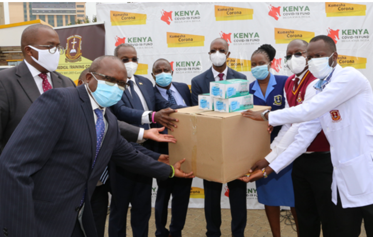
Students receive Personal Protective Equipment from the Kenya COVID -19 Fund Board and EQUITY Group representatives