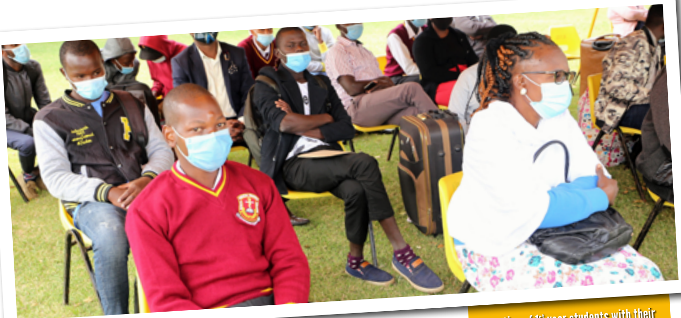
A section of 1 st year students with their parents/guardians during reporting day

At KMTC Nairobi Campus, first-year students accompanied by their guardians started streaming into the Campus compound as early as 6 am.