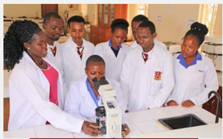
Students during a training in the Medical Sciences laboratory

As part of the core mandate of the College, KMTC has continued to focus on building the capacity of staff and students alike to conduct research, key for developing new knowledge and finding solutions to problems that continually arise in the health sector