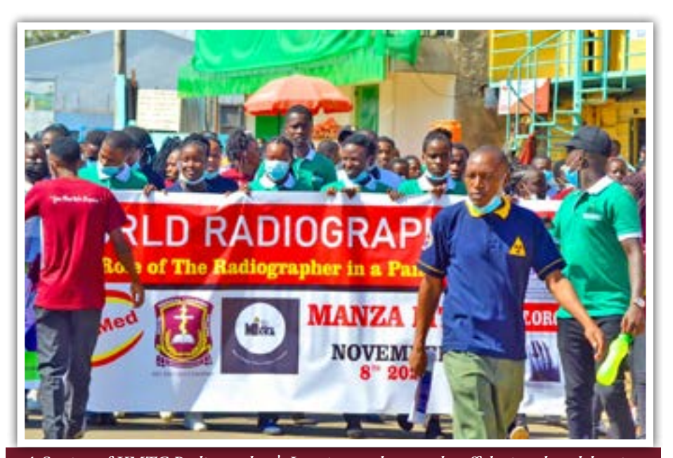
A Section of KMTC Radiography & Imaging students and staff during the celebration

"Diagnostic Radiographers have become an instrumental part of the process in determining if a patient has COVID-19, and how they are progressing and recovering from it," he said.