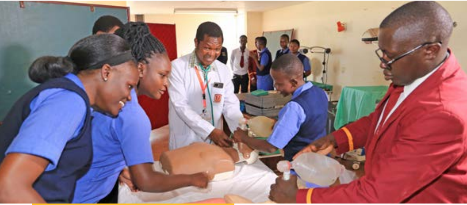
A section of students during a training in the skills laboratory

Following a successful evaluation by the Kenya National Qualifications Authority (KNQA), KMTC has been accredited as a Qualification Awarding Institution (QAI).