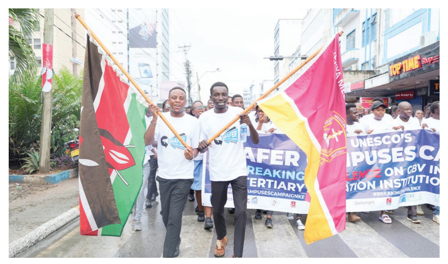
KMTC students drawn from coastal region Campuses and stakeholders during the launch of safer Campuses Campaign in Mombasa Campus.

er, more inclusive learning environments, brought together students and staff from KMTC Mombasa, Port Reitz, and Kilifi Campuses, as well as stakeholders from the University of Nairobi - Mombasa Campus. The launch featured a commemorative walk from Makadara Grounds to KMTC Mombasa, the commissioning of a Safe Space, tree planting activities, and inspiring addresses from key leaders.