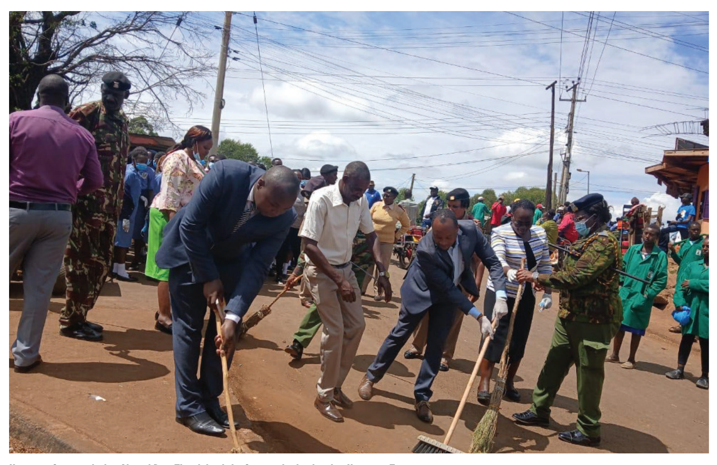
Kangema Campus during Alumni Day. They joined the Community in cleaning Kangema Town.