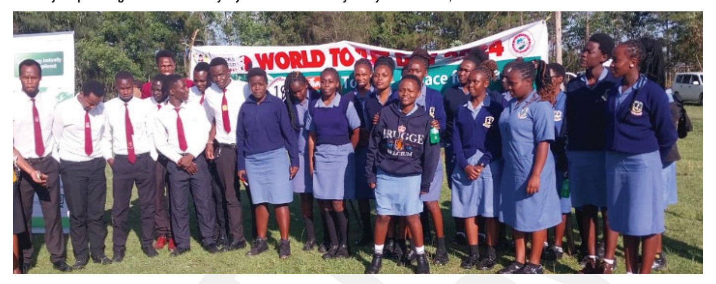
A section of Bomet Campus students during the World Toilet Day celebration on November 19, 2024.