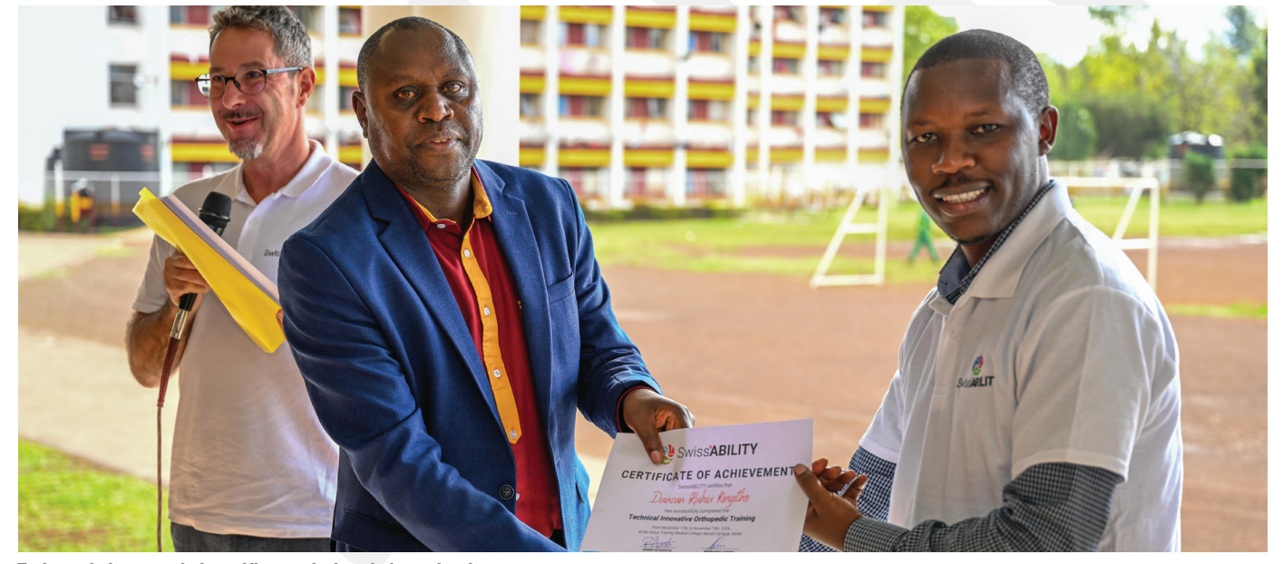
Trainees being awarded certificates during their graduation.