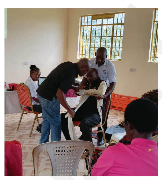
First Responders Training for Boda Boda operators at Rera Campus on November 30, 2024.