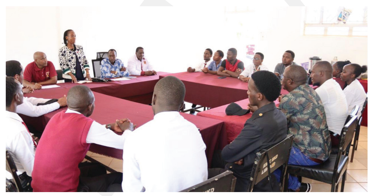
Makindu Campus during Alumni/Cultural Day on November 9, 2024.