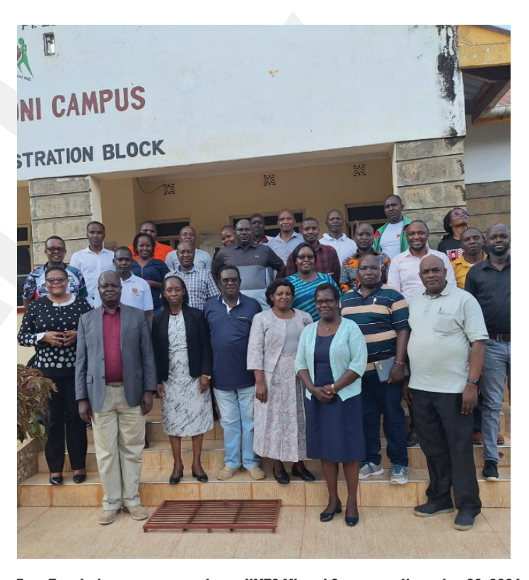
Zone Two during a sports meeting at KMTC Mbooni Campus on November 28, 2024.