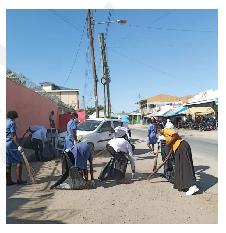
Lodwar Campus during a community cleaning exercise in Lodwar Town, on November 9, 2024.