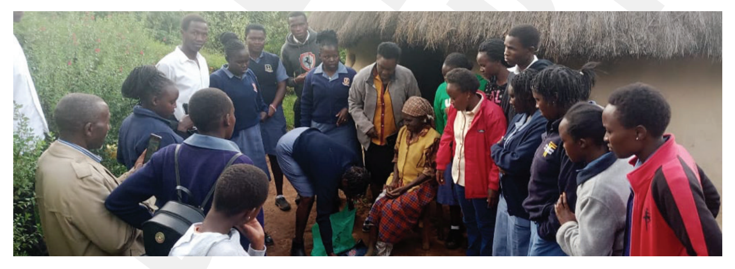
Mosoriot Campus marked World Toilet Day by constructing a toilet in Sogoo, Narok County, on November 19, 2024, as part of their community diagnosis action plan to promote public health and sanitation.