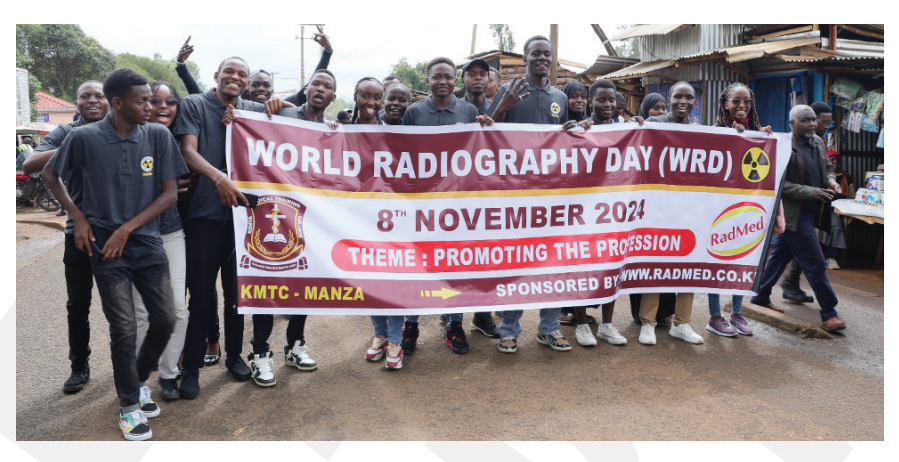
A section of Manza Campus Radiography and Imaging students during the World Radiography Day 2024 in Machakos county.

While Nyeri Campus hosted the main event, other campuses joined in marking the day through locally organized activities that highlighted the profession's impact. These activities included community outreach programs aimed at raising awareness about diagnostic imaging, workshops and exhibitions to educate students and the public on radiogra-