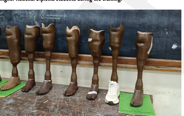
Knee Prosthetic limbs made using Monolimb Technology.