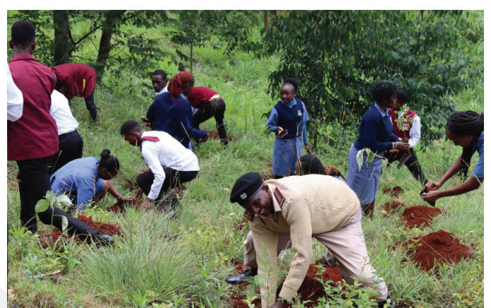
Nyeri Campus joined the community to grow trees donated by Kingdom Bank Nyeri Branch on November 19, 2024