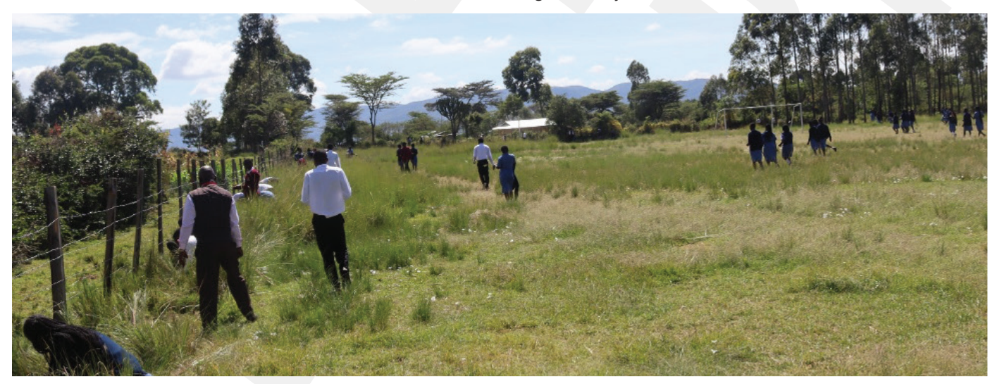
Bomet Campus first year students during a tree growing exercise on November 15, 2024.