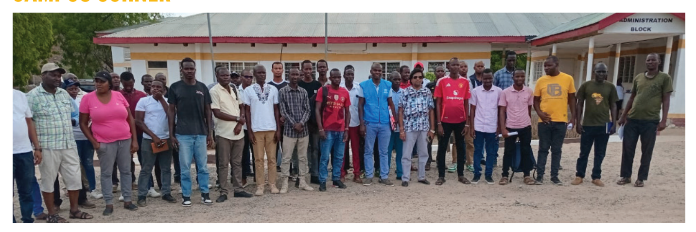
Stakeholders at Lodwar Campus during a UNHCR projects site visit on November 18, 2024.