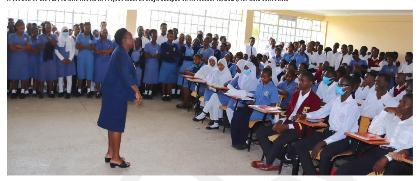
Isiolo Campus during a student's sensitization forum on security vigilance on November 11, 2024.