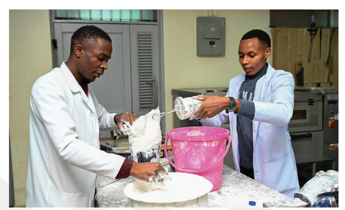
Trainees during the session.