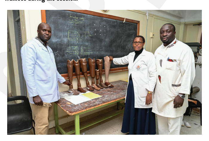
Higher National Diploma students and trainer during a session.