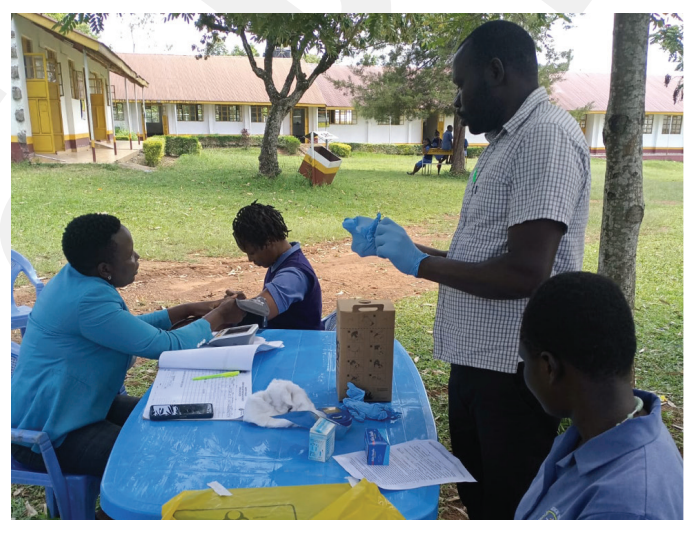
Rera Campus during a blood donation exercise on November 27, 2024.