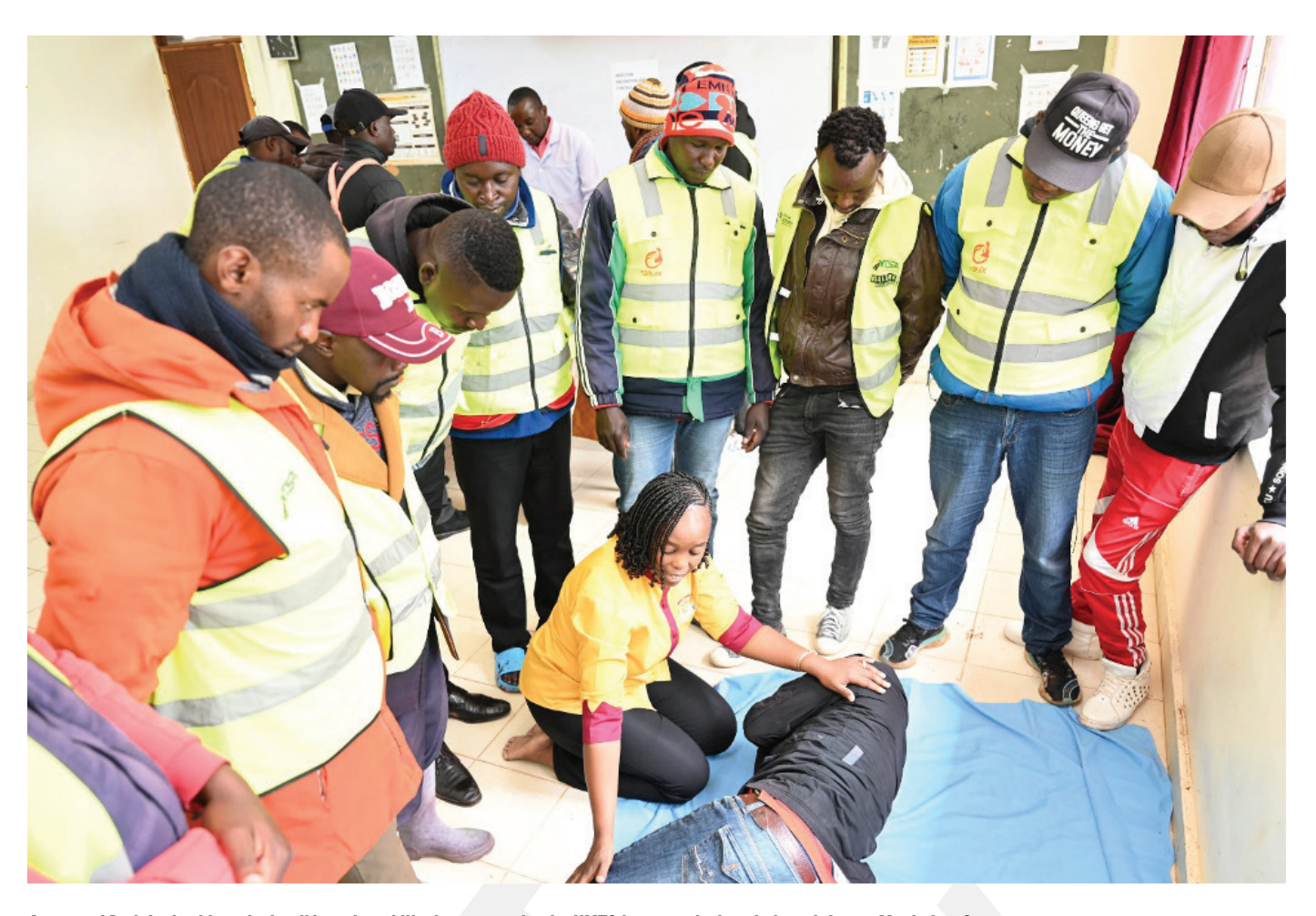
A team of Bodaboda riders during lifesaving skills demonstration by KMTC lecturer during their training at Machakos Campus.

he College has launched a groundbreaking training initiative for boda boda riders on November 28, 2024, bringing together 100 riders from across Machakos County. The program is designed to equip the riders with essential emergency response skills, enhancing their ability to save lives within their communities.