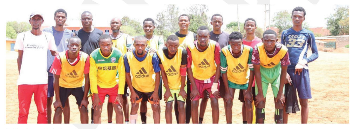
Makindu Campus Football team during Alumni/Cultural Day on November 9, 2024.