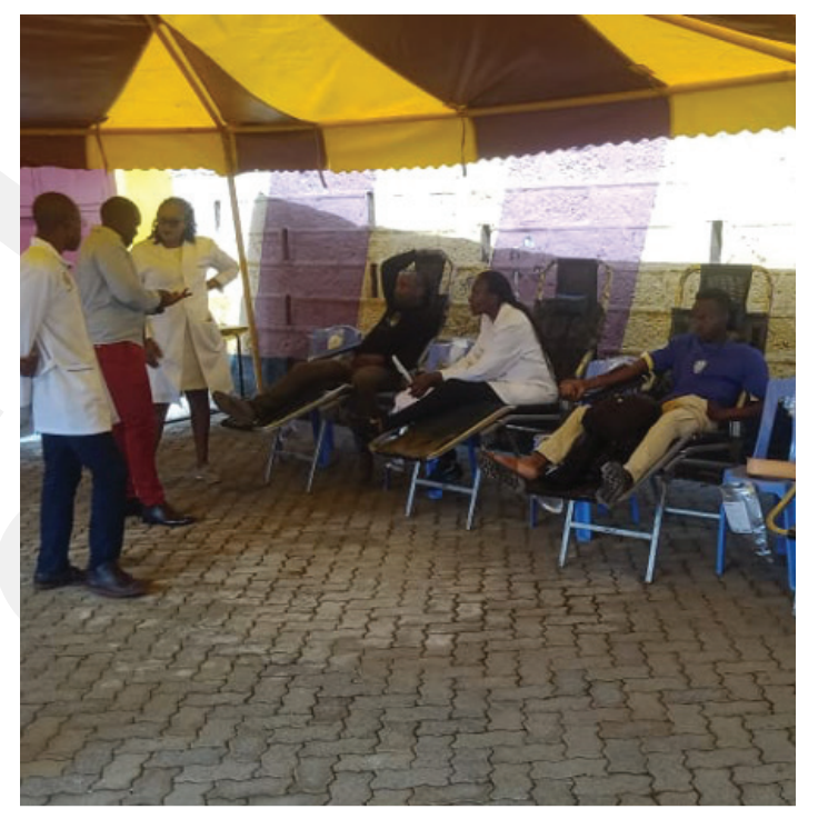
Nyeri Campus during a blood donation drive to mark World Radiography Day on November 8, 2024.