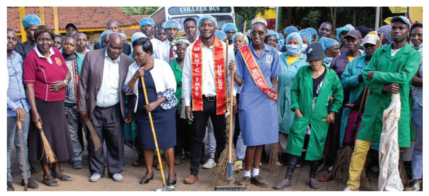
Embu Campus joined the community during a clean-up exercise in the County November 9, 2024.