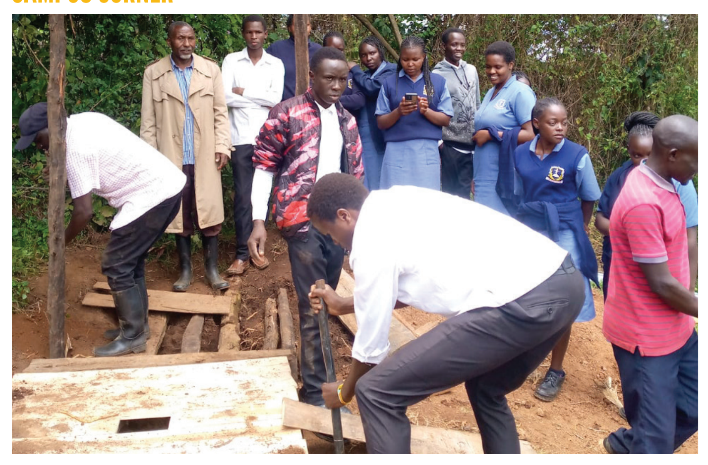
Mosoriot Campus marked World Toilet Day by constructing a toilet in Sogoo, Narok County, on November 19, 2024, as part of their community diagnosis action plan to promote public health and sanitation.