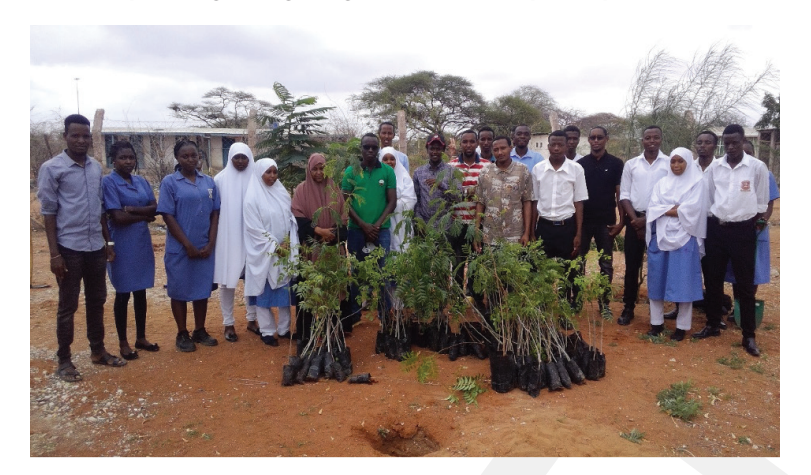
Wajir Campus partnered with the Minsirty of Forestry to grow 200 trees (November 27, 2024).