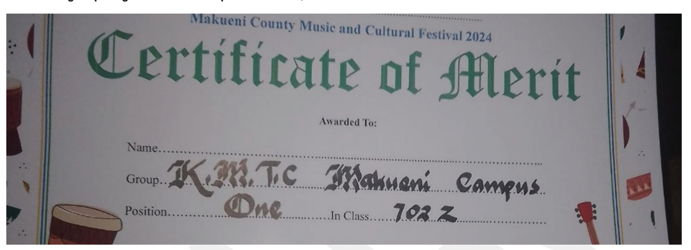
Makueni Campus Music Club earned top honors at the Makueni County Music and Cultural Festival, securing a spot at the National Festival.