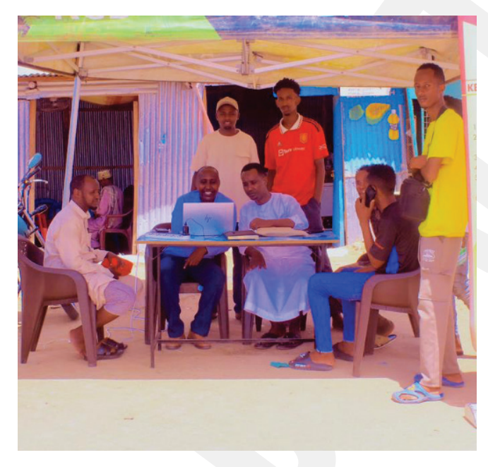
Mandera Campus during mobilization of Students at Mandera bus Park on November 8, 2024.