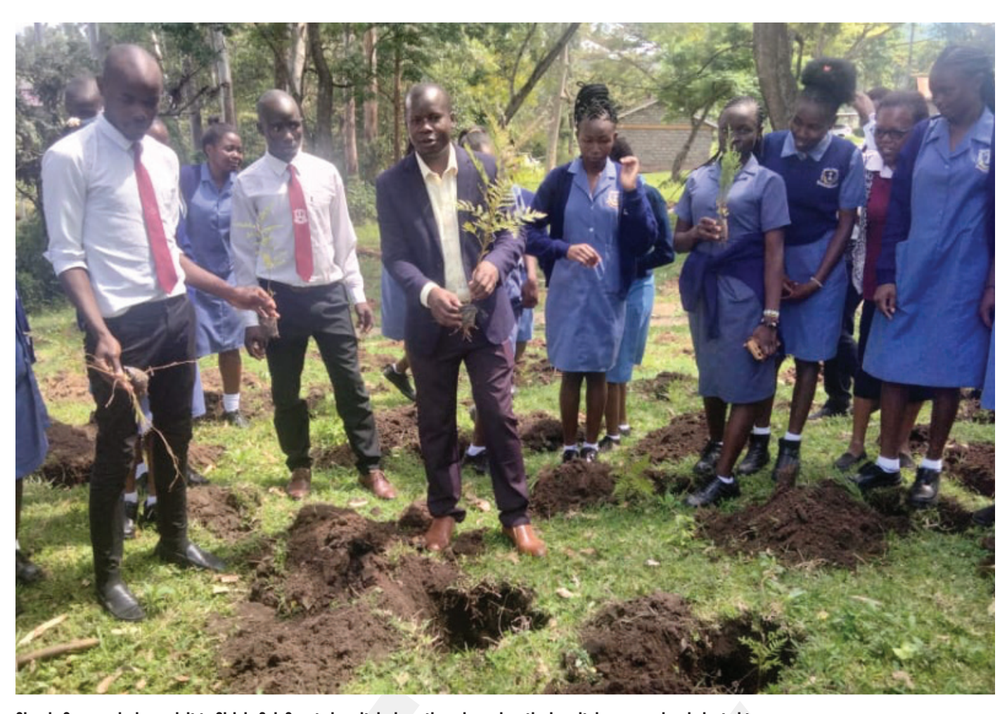
Chwele Campus during a visit to Sirisia Sub County hospital where they cleaned up the hospital compound and planted trees.