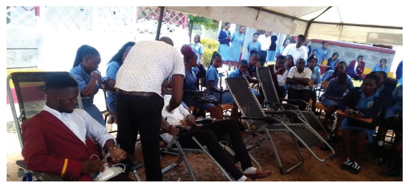
Students and staff from Makueni campus participating in blood donation exercise on November 18, 2024.