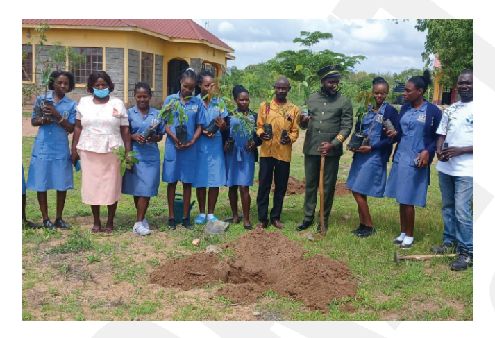
Kitui Campus during a tree growing exercise at Mutomo satellite on November 28, 2024.