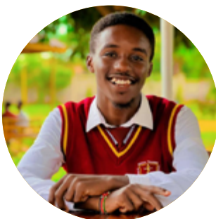
Mr. William Noah Mwai Makindu Campus

We extend our heartfelt condolences to their families, friends, and colleagues during this difficult time.