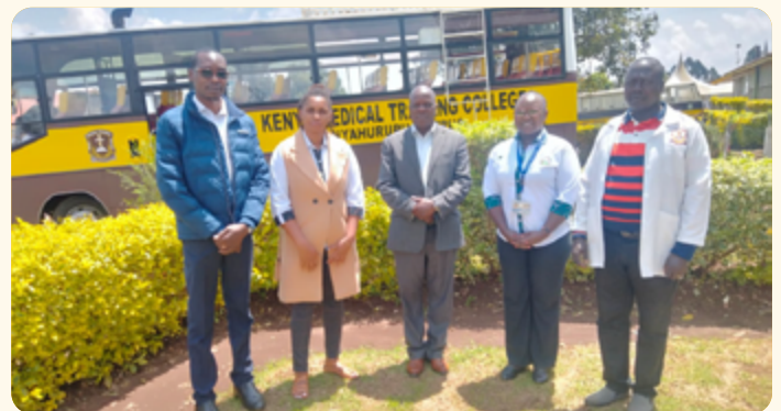
KMTc staff and Nursing Council of Kenya officials during a visit to Nyahururu Campus.

Following a successful intake of nursing students, KMTc Nyahururu hosted a team from the Nursing Council of Kenya, Standards Department. The purpose of the visit was to evaluate their readiness for approval to conduct a second intake of nursing students.