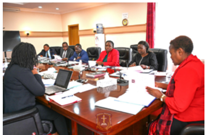
Board's Finance, Planning and Development Committee during a meeting at the headquarters.