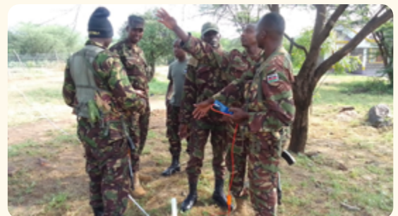
KDF surveyors at Chemolingot Campus.

President Ruto emphasized the importance of education in transforming the region, urging residents to embrace learning and shun detrimental practices like cattle rustling. “We have built KMTC and other technical training institutions to provide your children with opportunities for education and employment,” he stated.