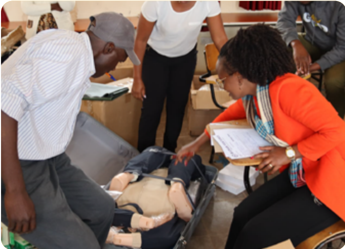
KMTC Mbooni receives skills lab equipment in preparation for mounting nursing programme.