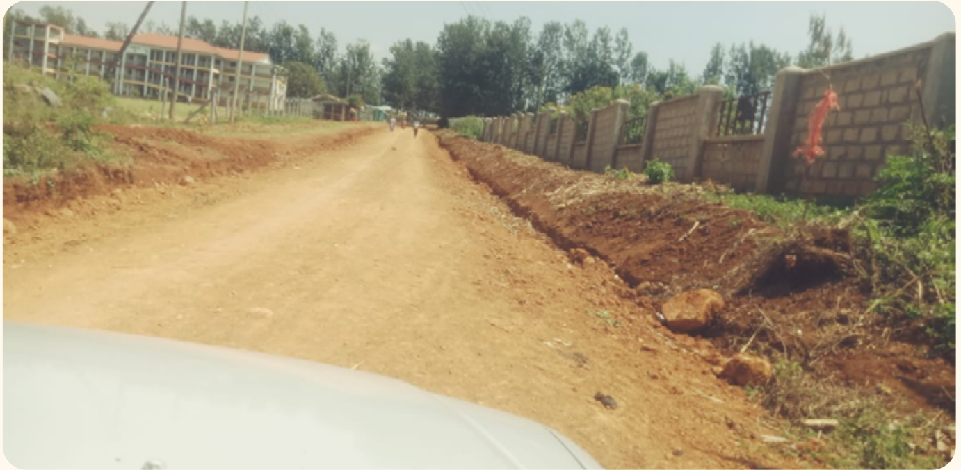
Awendo Campus access road.

In collaboration with the County Government of Migori, KMTC Awendo Campus now benefits from a newly gravelled and improved half-kilometer access road, enhancing accessibility for students and staff.