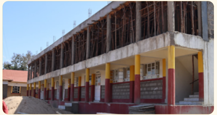
Mbooni Campus tuition block under construction.

The second phase of construction is a crucial step in realizing the campus's vision for improved educational facilities.