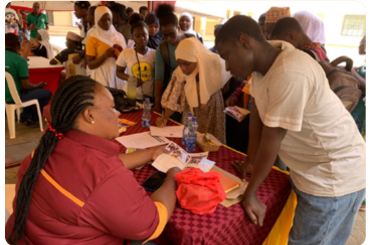
Kwale and Msambweni campuses during the PEPEA scholarship program career mentorship.