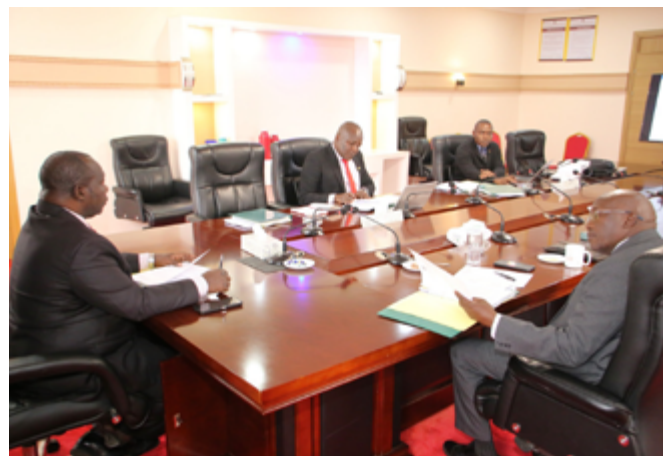
Board's Audit Committee during a session at the headquarters.