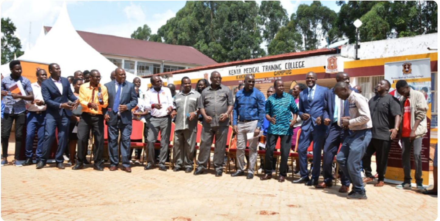
Kakamega Campus Alumni showcase their dancing skills during the launch of the Alumni Chapter.

O n August 9, 2024, KMTTC Kakamega witnessed a momentous event as alumni from various graduating classes converged on the campus grounds to build a robust and supportive alumni network. The gathering was marked by a spirit of unity and commitment to strengthening connections among former students.